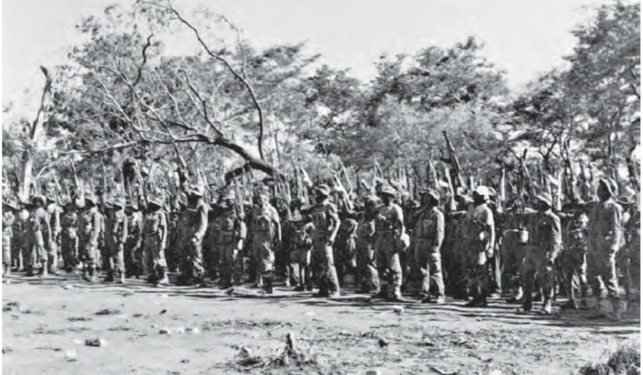
Renamo fired up!