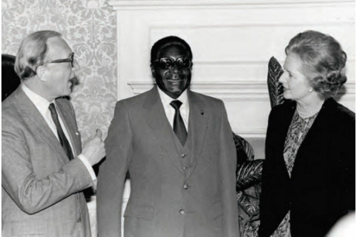
Foreign Secretary Carrington, Robert Mugabe and Prime Minister Margaret Thatcher. Ian Smith described Carrington as ‘the most evil man I ever met.’