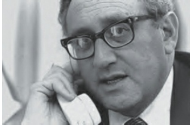
US Secretary of State Henry Kissinger; tried hard to end the war and earned Ian Smith's respect.