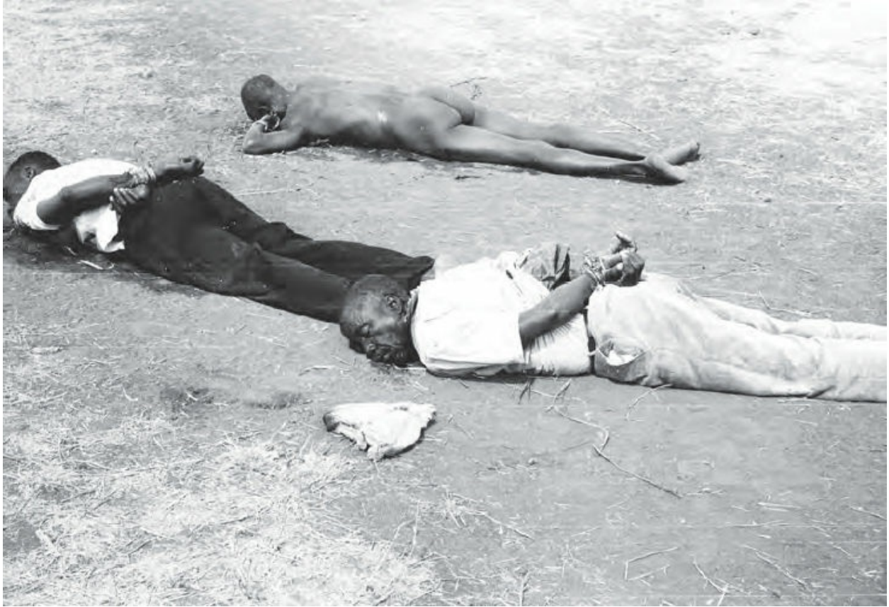
Suspected collaborators murdered.