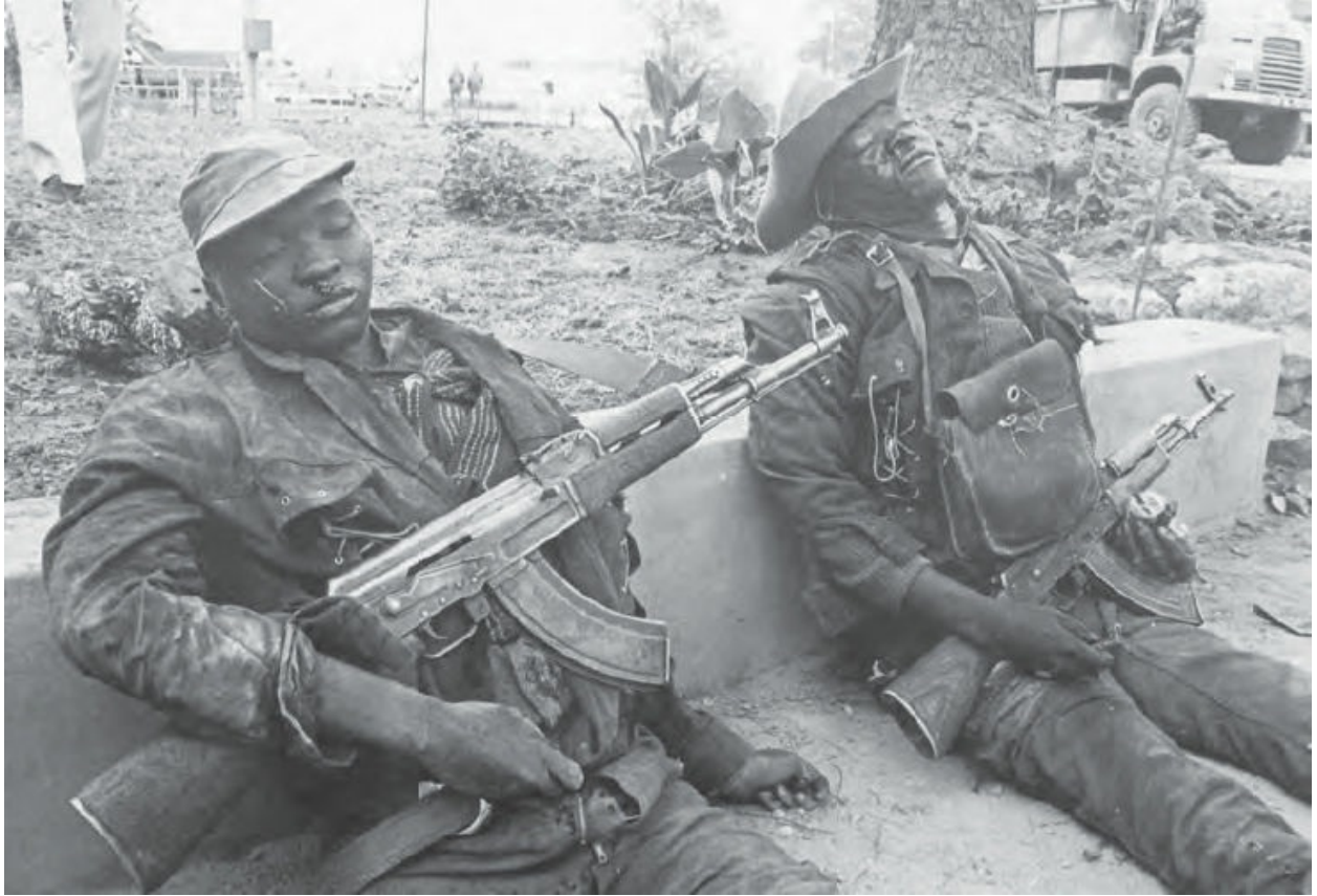
ZANLA men killed in the north-east of the country.