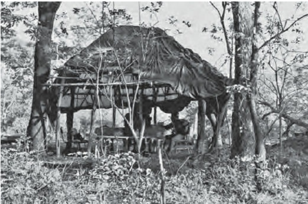
Darrell Watt's headquarters in southern Mozambique.