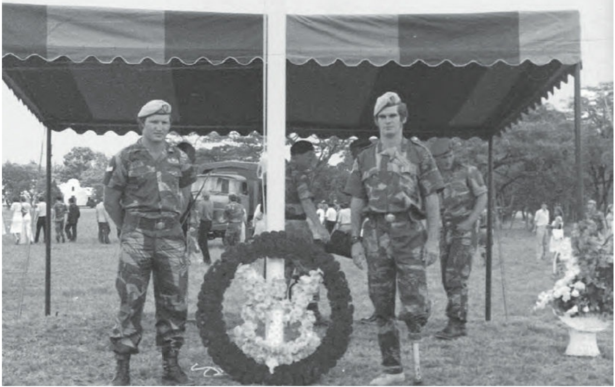
Final ceremony; the end of the Rhodesian SAS.