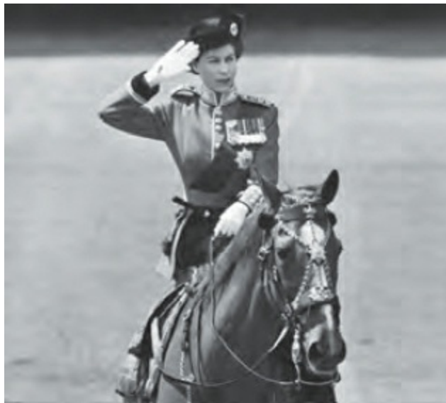
Queen Elizabeth; played a pivotal role in bringing Mugabe to power.