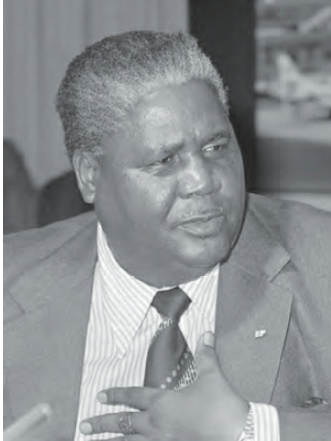
Joshua Nkomo; took responsibility for the downing of the Viscounts.