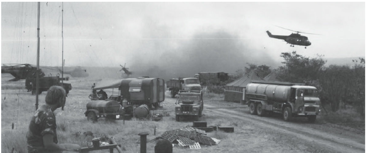
Choppers on their way to Barragem.