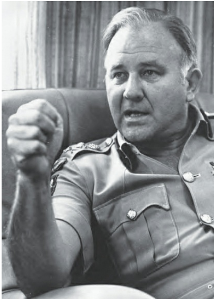
Rhodesian military supremo General Peter Walls.

US President Jimmy Carter; determined to use US power to end white rule in southern Africa.