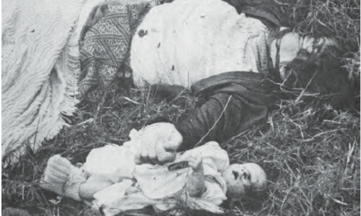
Mother and child slain at Elim Mission.