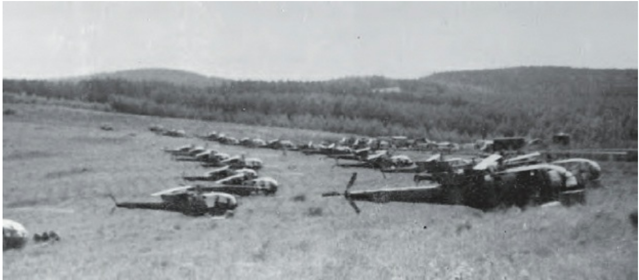
Choppers ready for raid into Mozambique.