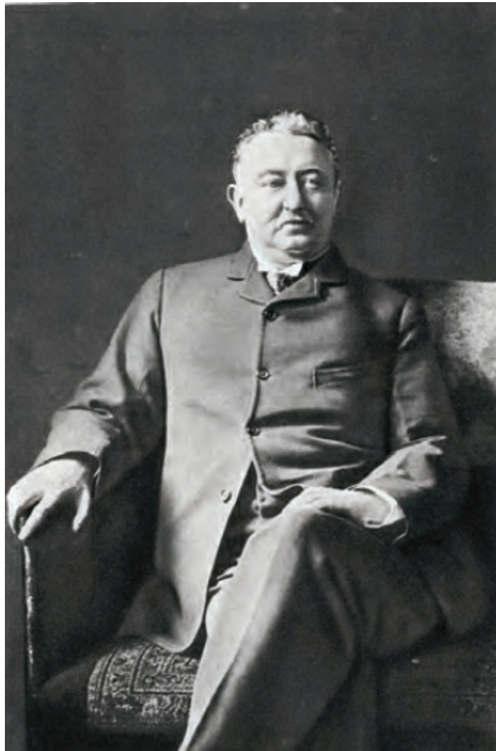
Cecil Rhodes; planted the seed of conflict.