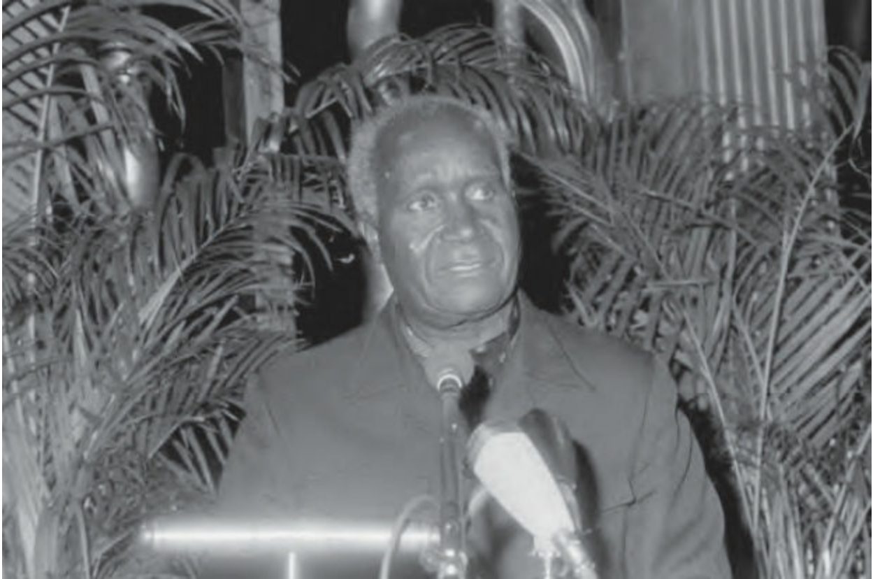
Zambian President Kenneth Kaunda.