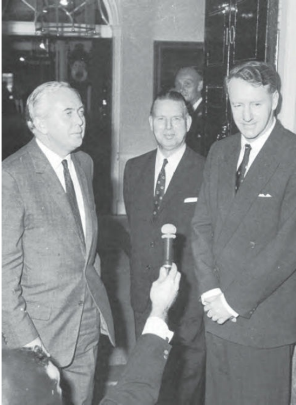
Ian Smith, Prime Minister of Rhodesia (right), and British Prime Minister Harold Wilson (left), 1965.