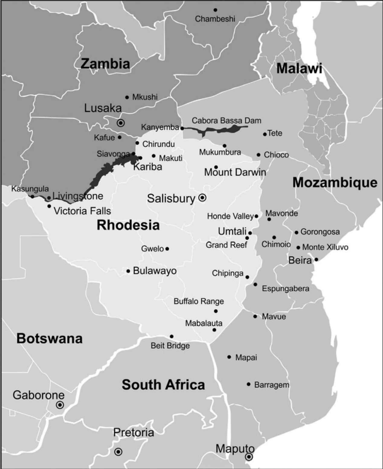
Points of Operational Significance