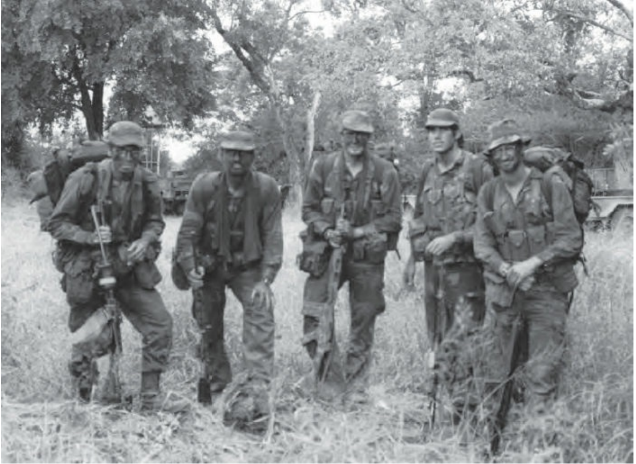
SAS operators ready to roll.