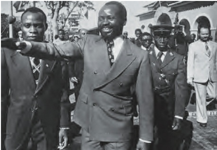
Mozambican President Samora Machel; severely pressured by the SAS.