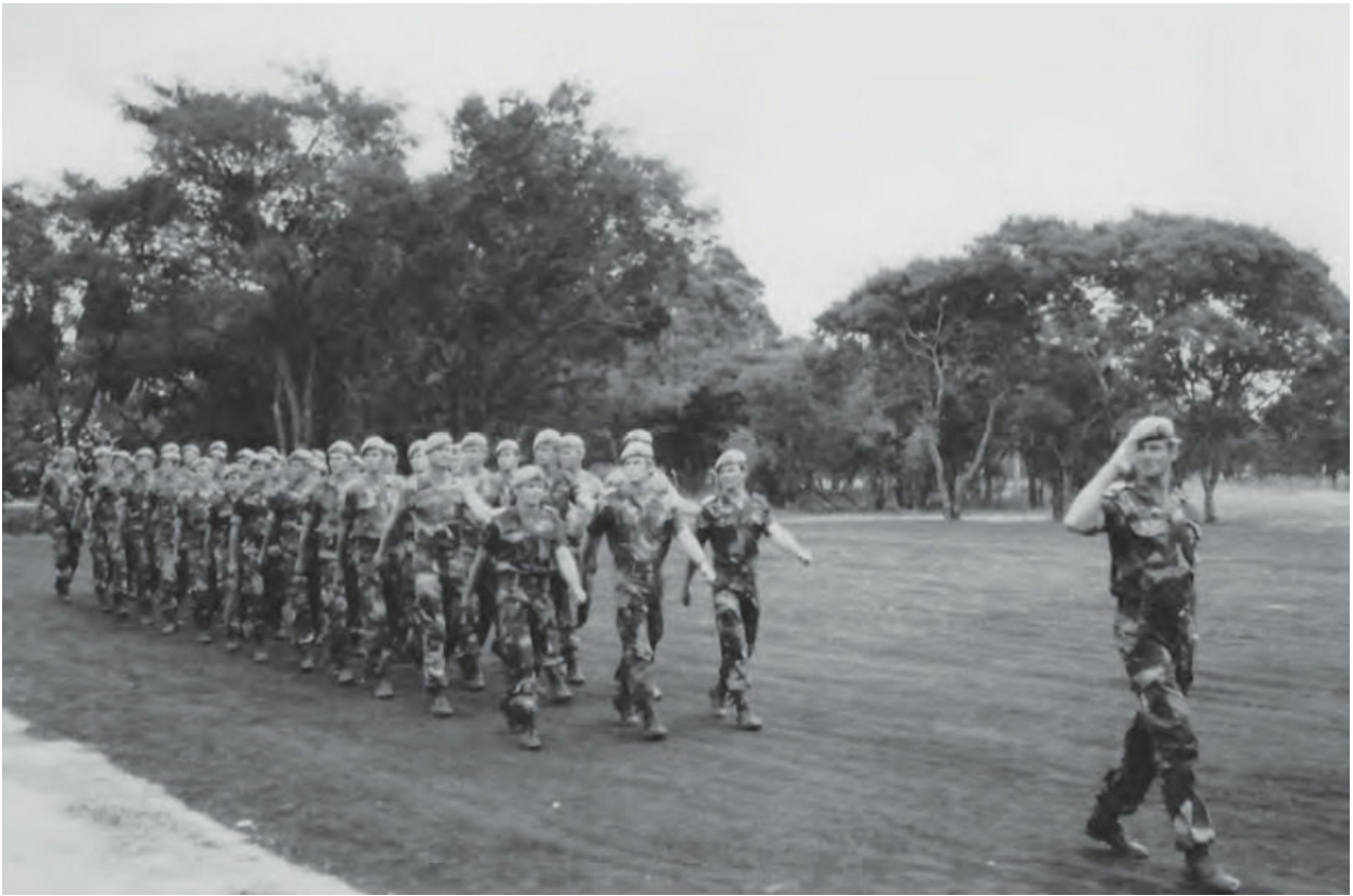
SAS on parade.