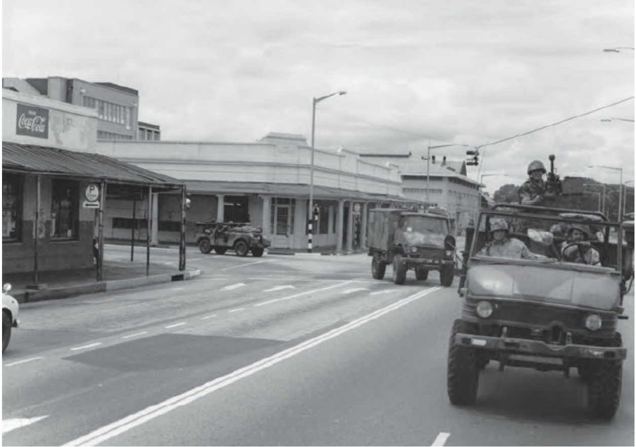
SAS prowl the streets of Salisbury looking for the trouble that never came.