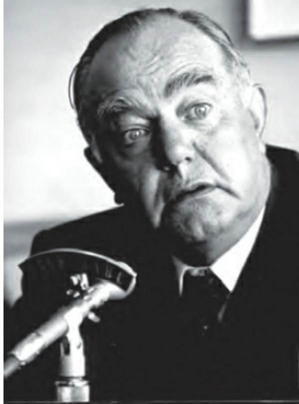
South African Prime Minister John Vorster; used Rhodesia as South Africa's sacrificial lamb.