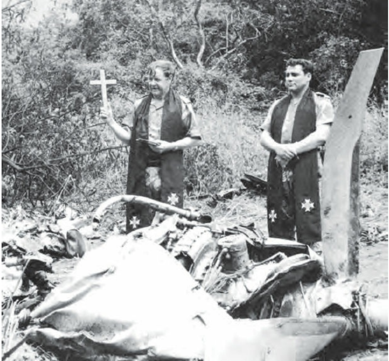
Consecration service at the wreckage of the 2nd Air Rhodesia Viscount airliner shot down by Zipra.