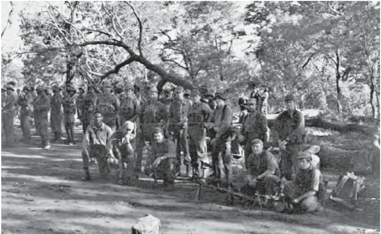
SAS men and their Renamo allies.