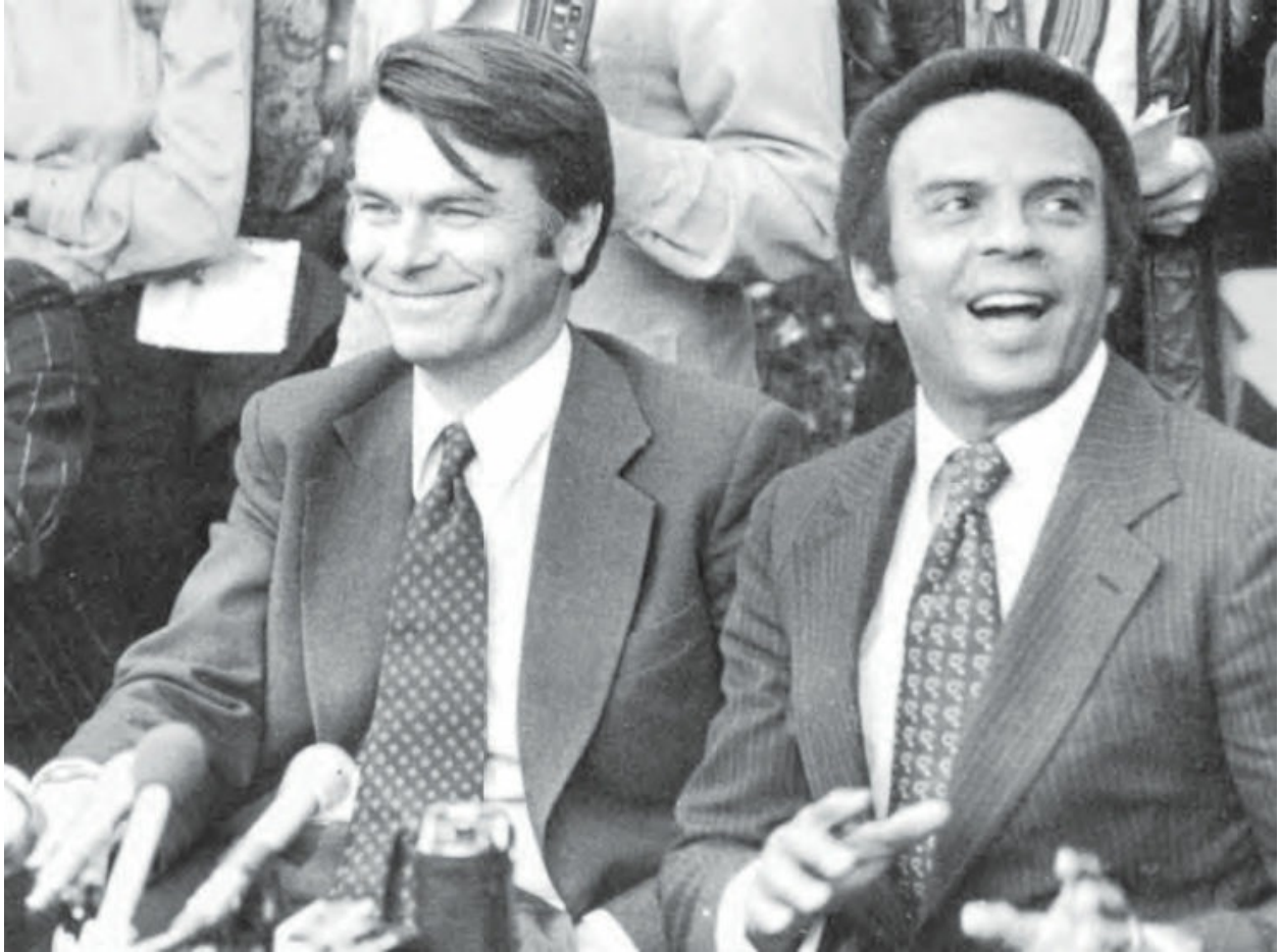
British Foreign Secretary David Owen and Andrew Young, Jimmy Carter's UN Ambassador.