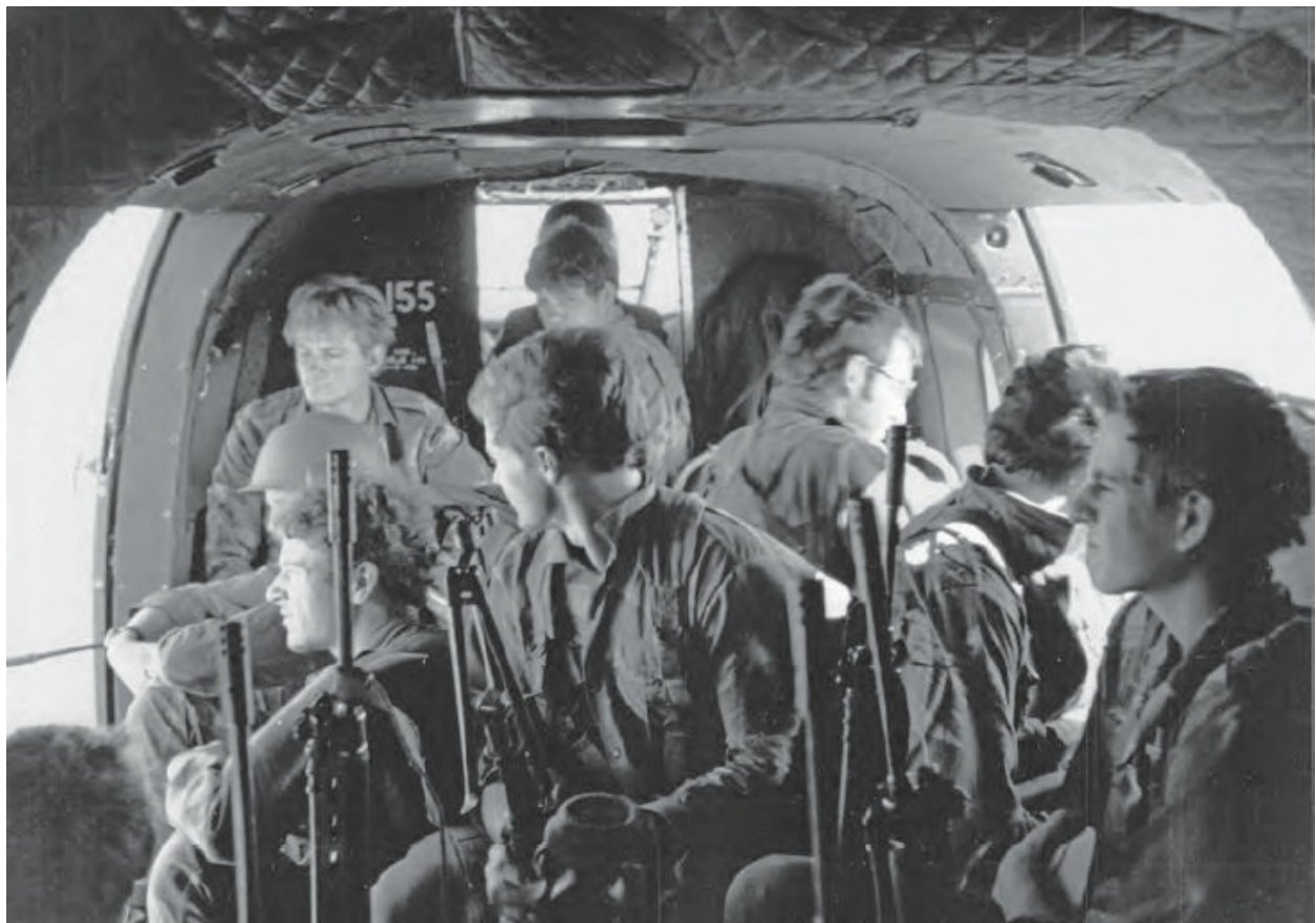
Pensive troops ready for battle.