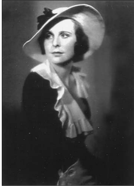
(right) Leni Riefenstahl