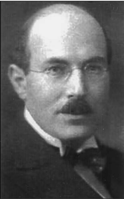
(left) Victor Gollancz