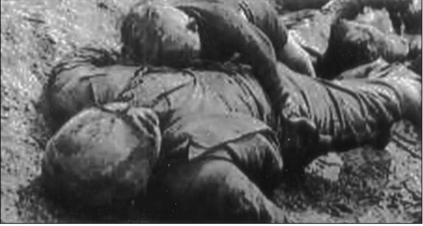
(above) After the Fire Storm