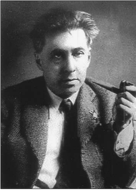
(left) Ilya Ehrenburg

UNLESS OTHERWISE NOTED, PHOTOS ARE IN THE PUBLIC DOMAIN