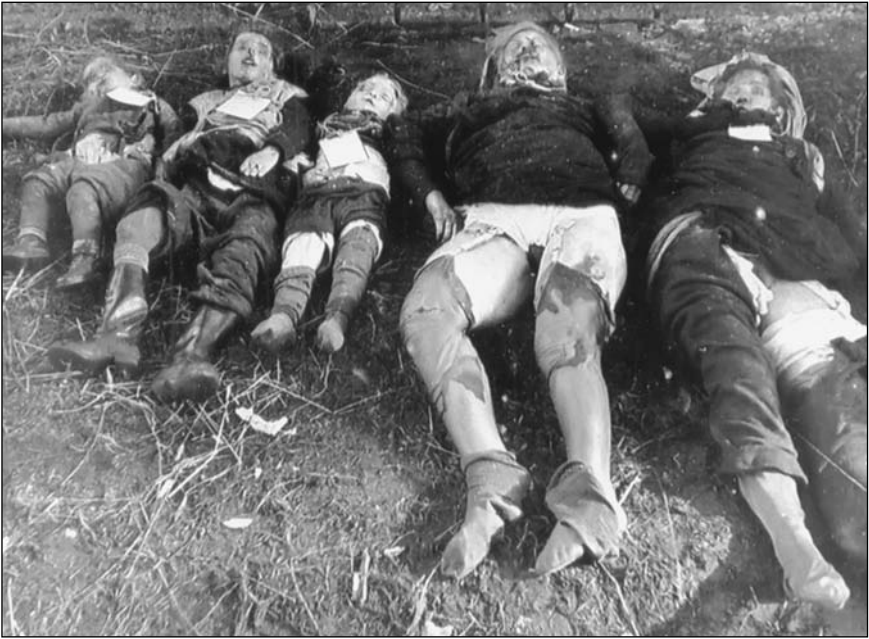
The "Good War"