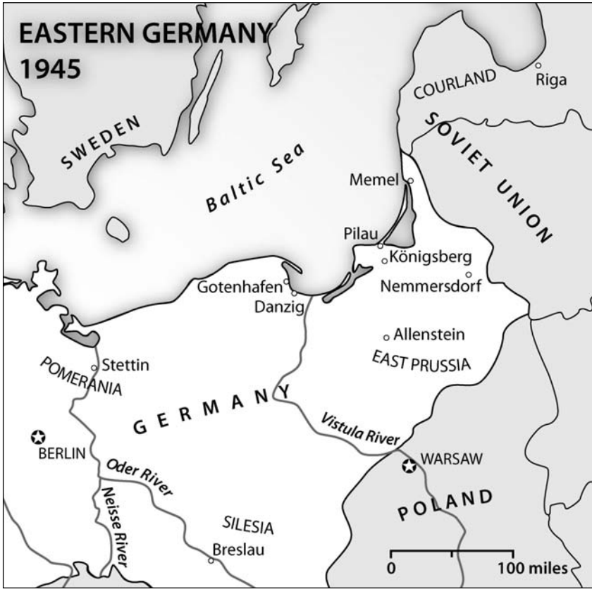
MAP BY JOAN PENNINGTON