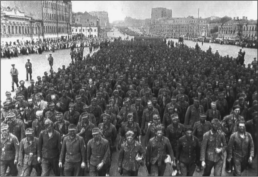
(above) On the Road to Siberia