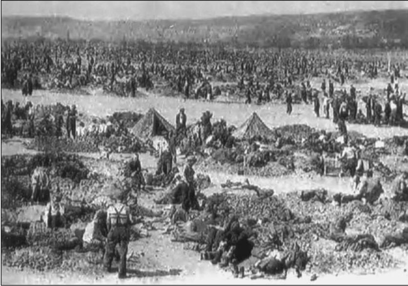
(above) American Death Camp