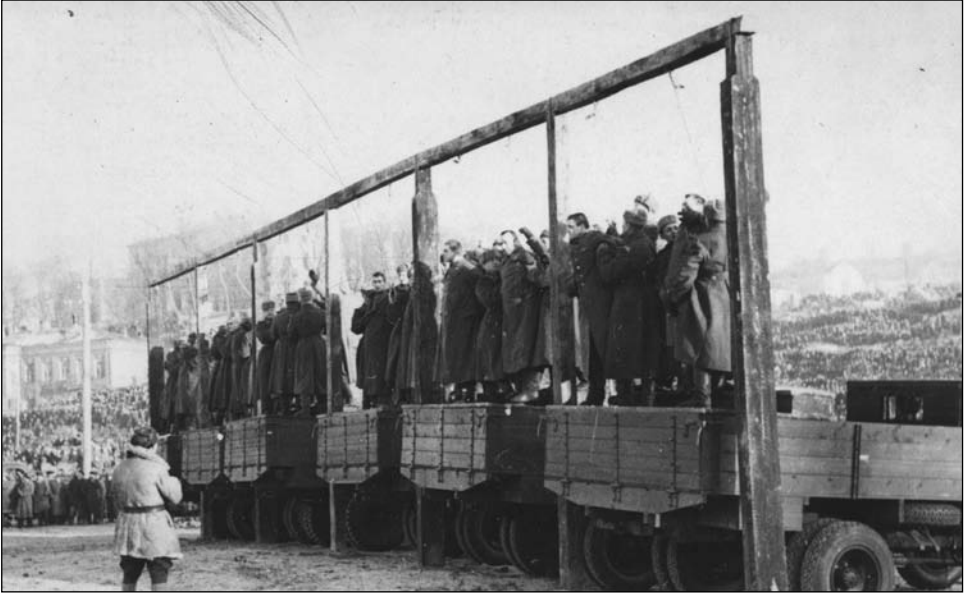
Public execution of Germans on Kreschatik. Kiev, 1946.