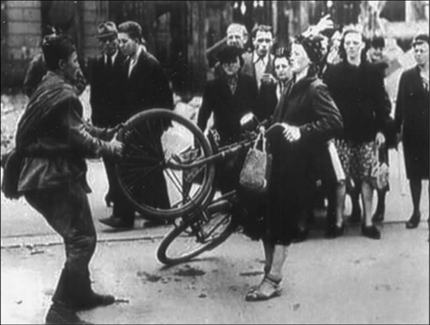
(above) The Spoils of War