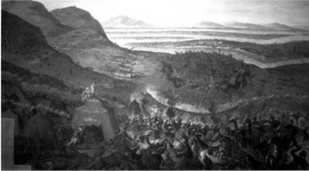
3. Franz Geffels. The relief of Vienna on September 12, 1683. The Turkish armies, under Kara Mustapha, had surrounded Vienna since July 14. Imperial armies, including Polish troops under John Sobieski III, delivered the city. Historisches Museum der Stadt Wien, Vienna, Austria.