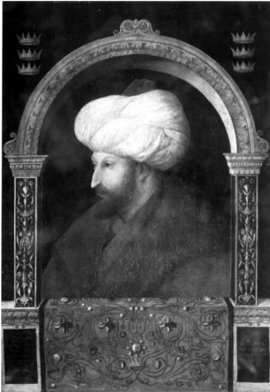
1. Mahomet II, the sultan of the conquest of Constantinople in 1453.

today Montenegro, the armies of King Lazar met as the invading Turks of Sultan Murad halted under the mountains of Kosovo. The two sides faced each other over the tiny rivulet of Schinitza that separated the two camps, and Murad wondered whether he should attack the Christian armies that seemed so much larger than his.