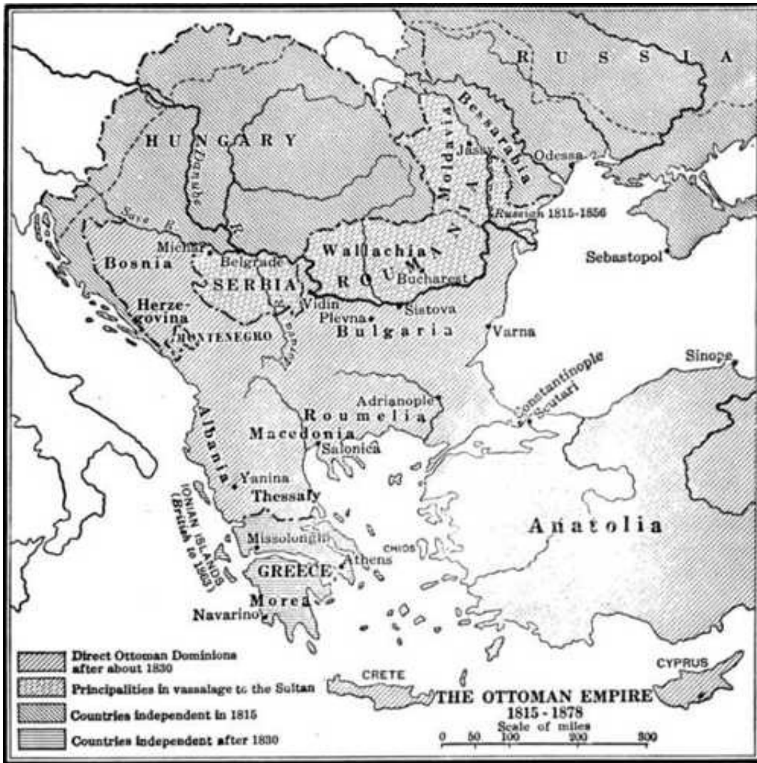
Source: William Stearns Davis, A Short History of the Near East (New York: Macmillan, 1922).

We are now in the year 1839 and fully involved in the exercise of power politics, with the Jihad now almost redundant. Britain was delighted to help, for London was determined to keep the Ottoman empire strong enough to confront the growing and worrisome power of Russia. A British naval squadron bombarded the Egyptian occupants in Beirut in August 1840 and landed a regiment of Turkish troops to take over the Egyptian-held town. The Egyptians also withdrew from Candia, in Crete, which they had occupied, and from Acre in Palestine. Under negotiations carried on through the good offices of France and