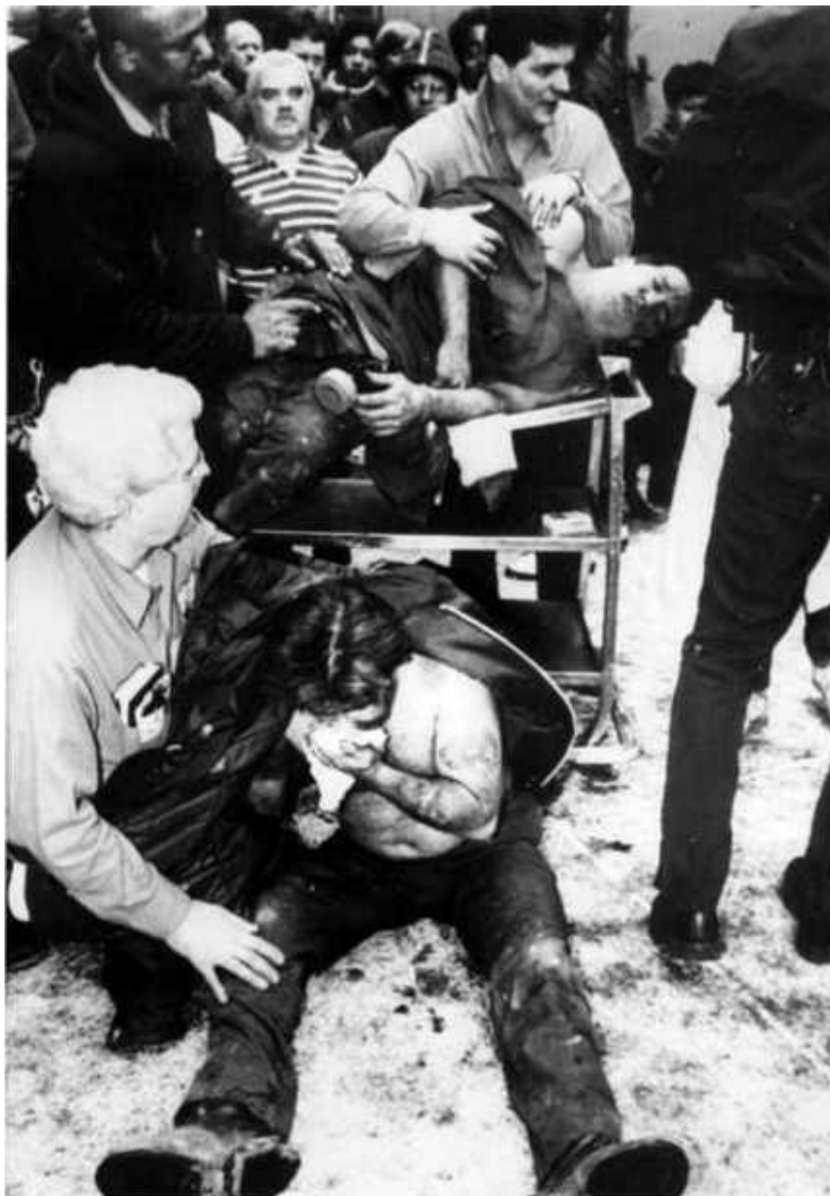
8. Victims being treated at the scene of the bombing of New York's World Trade Center on February 26, 1993. The bombing killed six and injured over a thousand. Six months after the blast, U.S. prosecutors obtained a massive indictment against the charismatic Muslim preacher Sheik Omar Abdel Rahman and fourteen followers.