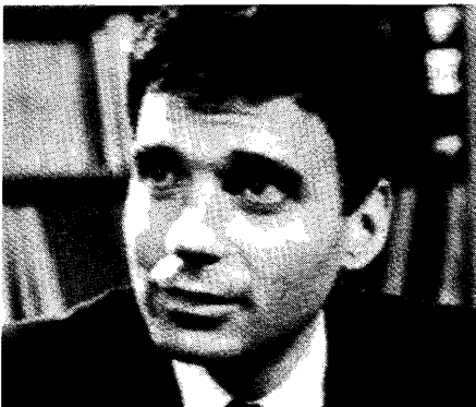
Corporate gadfly Nader

The Sept. 17 issue of Forbes casts an unblinking eye on the closest thing America has to a secular saint. The magazine doesn't find much to like in the man who has varying degrees of control over 29 organizations with revenues of $75-$80 million and assets of over $23 million. If what Forbes writers have revealed is true, Ralph Nader is a Grade-A hypocrite. Although he has made much over the years of his personal asceticism and tells even his close associates that he lives in "a simple room"