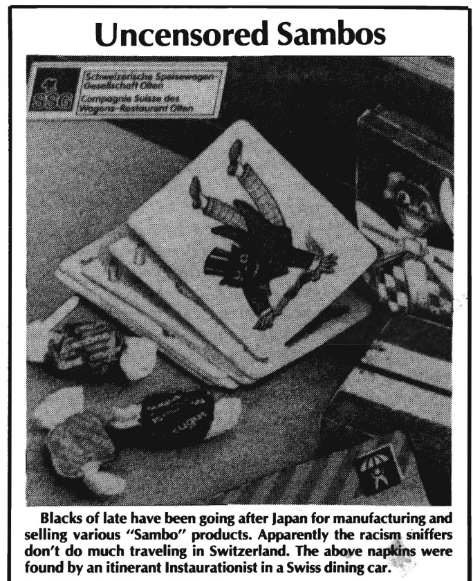
Blacks of late have been going after Japan for manufacturing and selling various "Sambo" products. Apparently the racism sniffers don't do much traveling in Switzerland. The above napkins were found by an itinerant Instaurantionist in a Swiss dining car.