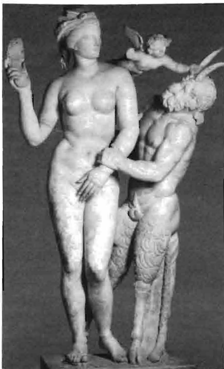
Eros to the rescue

An ancient illustration of this beauty/ugliness dichotomy is the statuary grouping of Aphrodite (Venus), Eros (Cupid) and the satyr god, Pan, from Delos (circa 100 B.C.) in the National Archaeological Museum in Athens. It is a work that is both aesthetically beautiful and eugenically instructive. Pan is shown grabbing Aphrodite with obvious intentions. She, however, rather than sub-