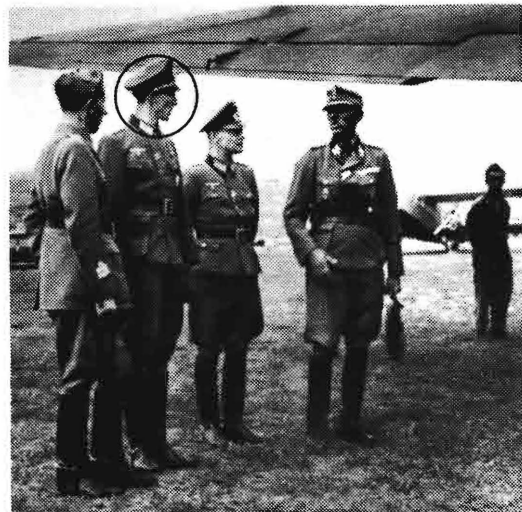
1942-1944 High level German Intelligence Officer 1972-1982 Secretary-General of the United Nations 1986- President of Austria

A few days after the Waldheim ban was announced, a high-level Justice Department delegation tried to justify the move to Austrian officials. The Americans reportedly