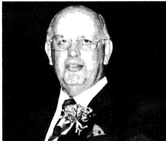
President P.W. Botha