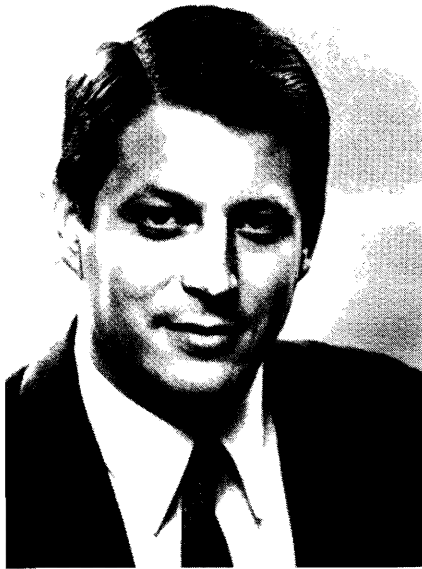
"New Southerner" Gore

Senator Albert Gore Jr. is playing the Carter card, the middle-of-the-road Southerner who advertises himself as being much less radical than the northern and western