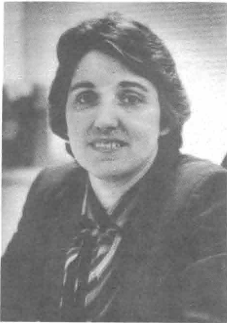
Smeal connected with blacks

Militant ELEANOR SMEAL , the angry little Calabrian-American woman, is back in control of the National Organization of Women (NOW). As Eleanor Cutri in Cleveland, she saw folks start abandoning the neighborhood when she and her family moved in. Some local girls were not permitted to date her brother. Then, in 1957, she entered Duke University and was "totally shocked" to find an all-white student body. "I immediately identified with the black struggle," she recalls. "The connections were so easy to make." In no time she was the leading campus agitator for race-mixing.