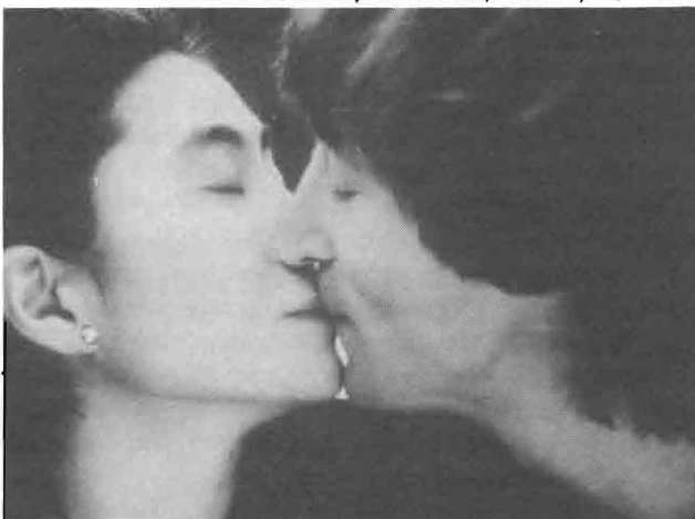
John Lennon and Yoko Ono

If the above wasn't a big enough dose of minority racism for one night, the viewer could also have tuned into John and Yoko: A Love Story on the NBC network (8:00 p.m., Transponder 8, Satcom 1R) for nostalgic Beatlemania with more than a soupçon of miscegenation, dope and murder. A pro-Castro epic, Cuba , was also on at 8:00 p.m. (Transponder 10, Galaxy 1) with