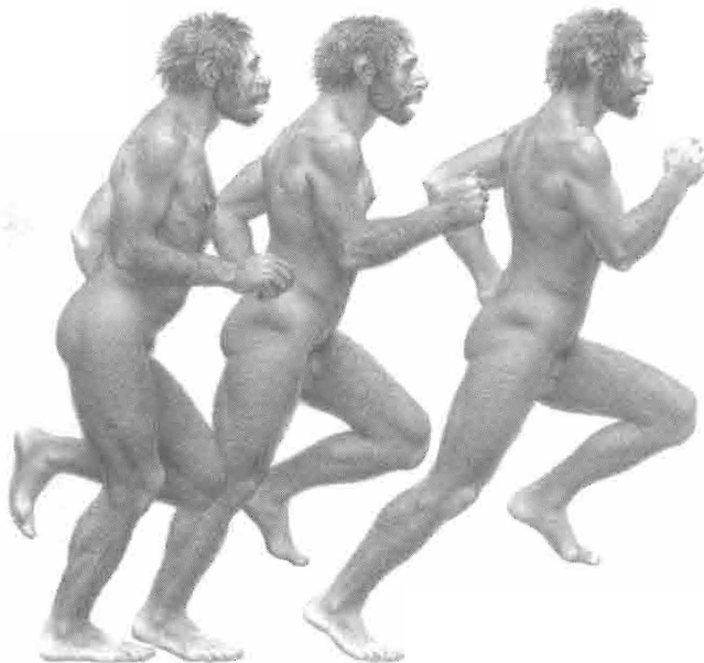
Archaic Homo sapiens, Neanderthal man, modern man