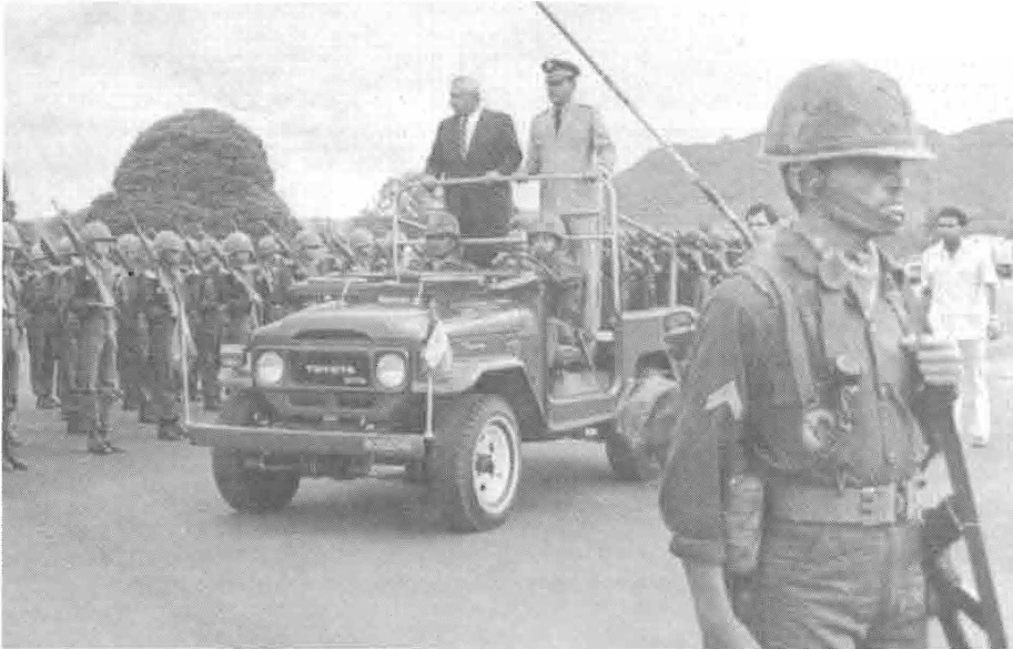
Sharon reviewing Honduran troops (1982)

For as long as the U.S. remained a Northern European country, the ceaseless feuds of mobs and oligarchy which bloody so much of the world left us unscathed. Today, when the ruthless military and Communist oligarchs of Central America, Southeast Asia and the Middle East are allying themselves with or against us -- and when the brown mobs fleeing from these countries crowd into ours -- it is easy to see how the "Lebanonization" process may build to a dreadful climax both here and there.