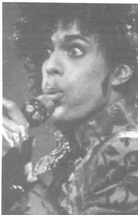
Prince -- no hit in Russia

Soviet Union. It was hard to argue with the newspaper Soviet Culture when it attacked the horse-faced mulatto singer Prince as the "king of repulsion" who is "brainwashing young Americans."