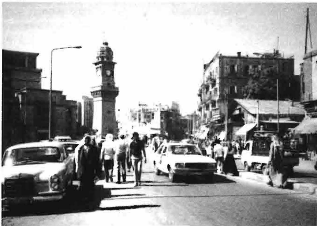
Aleppo street scene

In Aleppo I took the advice of a cabbie and got a room at the Venicia Hotel, near the landmark Bab el-Faraj clock-tower. The hotel printed a cute little brochure which contained an inadequately detailed map of the city. I took one and headed for the covered souk (market), supposed to be one of the best in the Mideast. I had my mind set on a wrought brass tray or an engraved dagger, but soon discovered that where tourists are few and far between, you're not likely to find any exotic souvenirs.