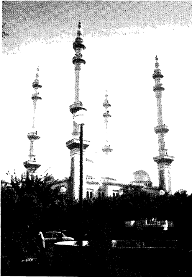
Ourouba Mosque, Aleppo

the Citadel for a splendid view of both the old and new sections of Aleppo. I paid a visit to the interesting archaeology and folk art museum, mailed a few postcards (with stamps commemorating the Olympic Games in Los Angeles), and stumbled upon a newsstand selling the International Herald-Tribune . Whose face adorned the cover? None other than Geraldine Ferraro's! What a place to learn about our first woman vice-presidential candidate!