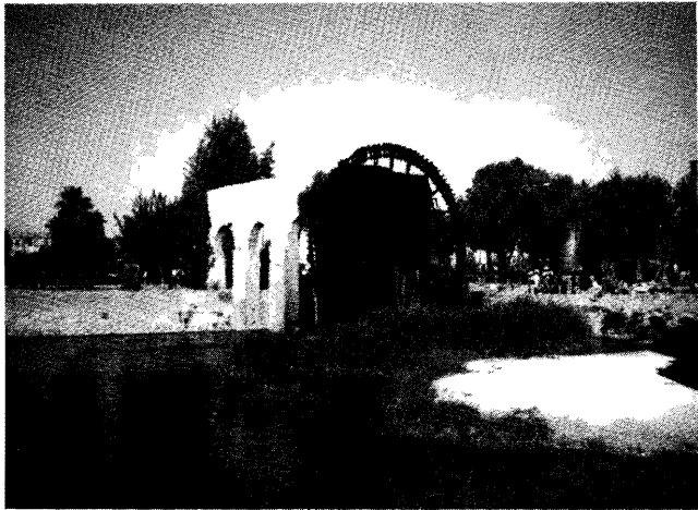
Ancient water wheels, Hama

ens were revolving on spits in the front window. I ordered half a chicken served on a bed of rice and a plate of pickled vegetables. After finishing my meal, I wandered over to the water wheels. They did look ancient, though it was hard to believe they had been turning for two millennia. They