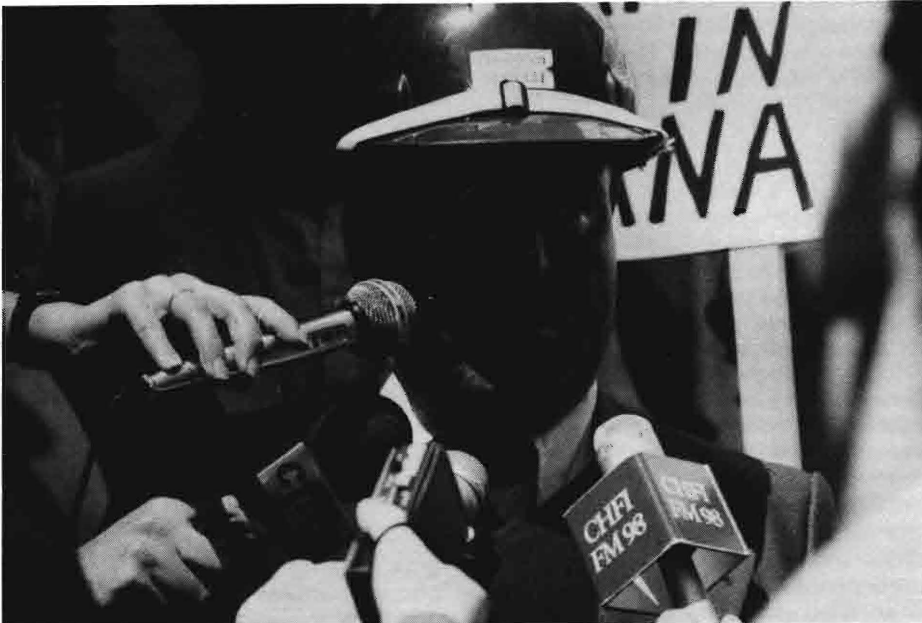
Ernst Zündel, in blackface, at deportation hearing.

This flair for symbols was in evidence again on April 29, as Zündel arrived at an Immigration Commission hearing with his face covered in charcoal. "I didn't get any justice as a white man," he told a mob of reporters, "so maybe I will as a black." Later, telling reporters how his deportation papers had been prepared in January , while his criminal trial was still in progress, Zündel remarked, "They would make good Nazis, these people. They follow orders . . ."