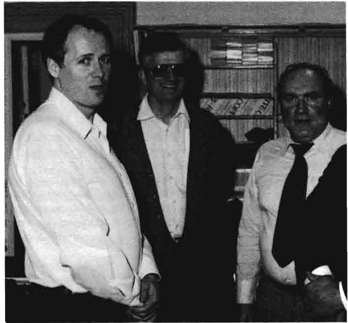
Left to right: Doug Christie, Jim Keegstra and Ernst Zündel.

The man they call the Battling Barrister was born in Winnipeg in 1946. His father was a tailgunner in the Royal Canadian Air Force in World War II. Though he wasn't exactly popular as founder and leader of the separatist party Western Canada Concept (WCC),