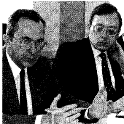
Israeli Defense Minister Moshe Arens lays down the party line to Ed Feulner

Needless to say, hardly an issue of Policy Review appears without multiple endorsements of Israel and Israeli-related policies, and this has become true of Heritage in general. Among the "high-ranking international figures to speak at Heritage during 1983," according to its annual report, was Israeli Defense Minister Moshe Arens. Domestic Zionists in the persons of Jeanne Kirkpatrick, Irving Kristol, Lew Lehrman and former UN Ambassador Charles