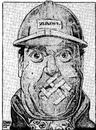
A Canadian cartoonist's perception of the defendant

The victors lost and the vanquished won in the great Ernst Zündel trial of 1985. That was the all-but-universal verdict of the Canadian mass media to the February 28 conviction of the Toronto revisionist publisher on charges of "knowingly" disseminating "false news" on the Holocaust, news likely to endanger social harmony. Given a 15-month sentence and jailed overnight until his lawyer could file Notice of Appeal, Zündel was acquitted on a related second charge, in which his allegedly false news pertained to an international conspiracy of Zionists, Freemasons and bankers.