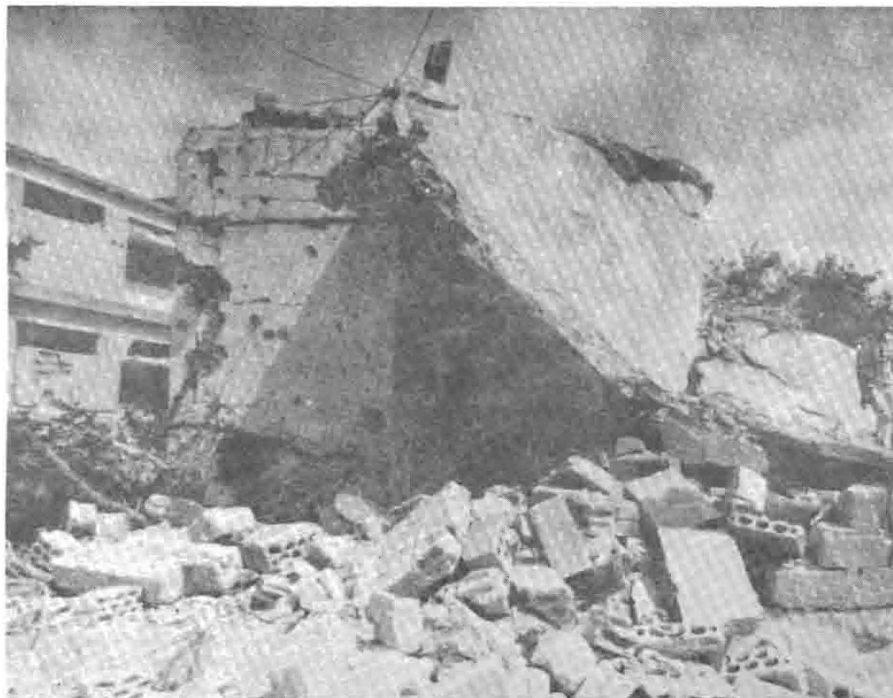
Village of Damour after an Israeli air attack

While the silence from Washington remains deafening, even British liberals are finally speaking out. Christopher Bourne writes in the New Statesman (Aug. 3, 1979):