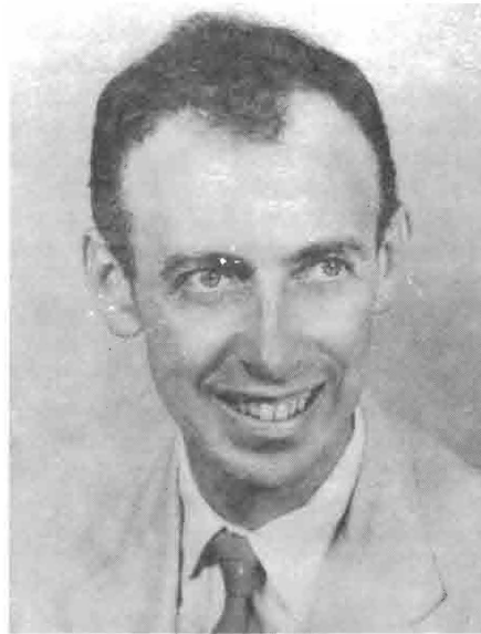
James D. Watson

If what they say about DNA is nonsense, do we have any compelling reason to listen to them when they come out against pesticides that give us shiny apples or tell us that the waters of the Mississippi are likely to give us cancer? I would like someone to set me right on such matters, but whom to trust now is not that clear.