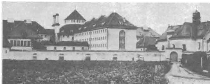
Landsberg Prison, where most of Mein Kampf was written.

themselves, and weakened them against internal forces of disruption. Take, for instance, the Allied propaganda against Austrian and Prussian imperialism. When the war ended, and the British and French expanded their empires under cover of League of Nations mandates, they were seen to be acting inconsistently, and therefore hypocritically. Naturally, this feeling was reflected in England and France as well. The propaganda vulture has a way of coming home to roost.