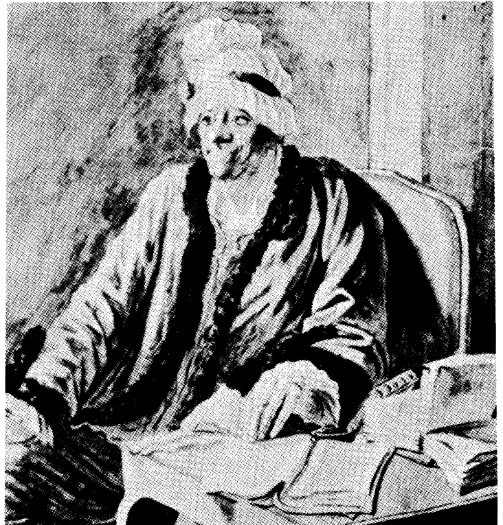
Voltaire, the Frenchifier

As the American sense of belonging was slowly undermined, outstanding thinkers became estranged from their country. Henry James and T. S. Eliot took