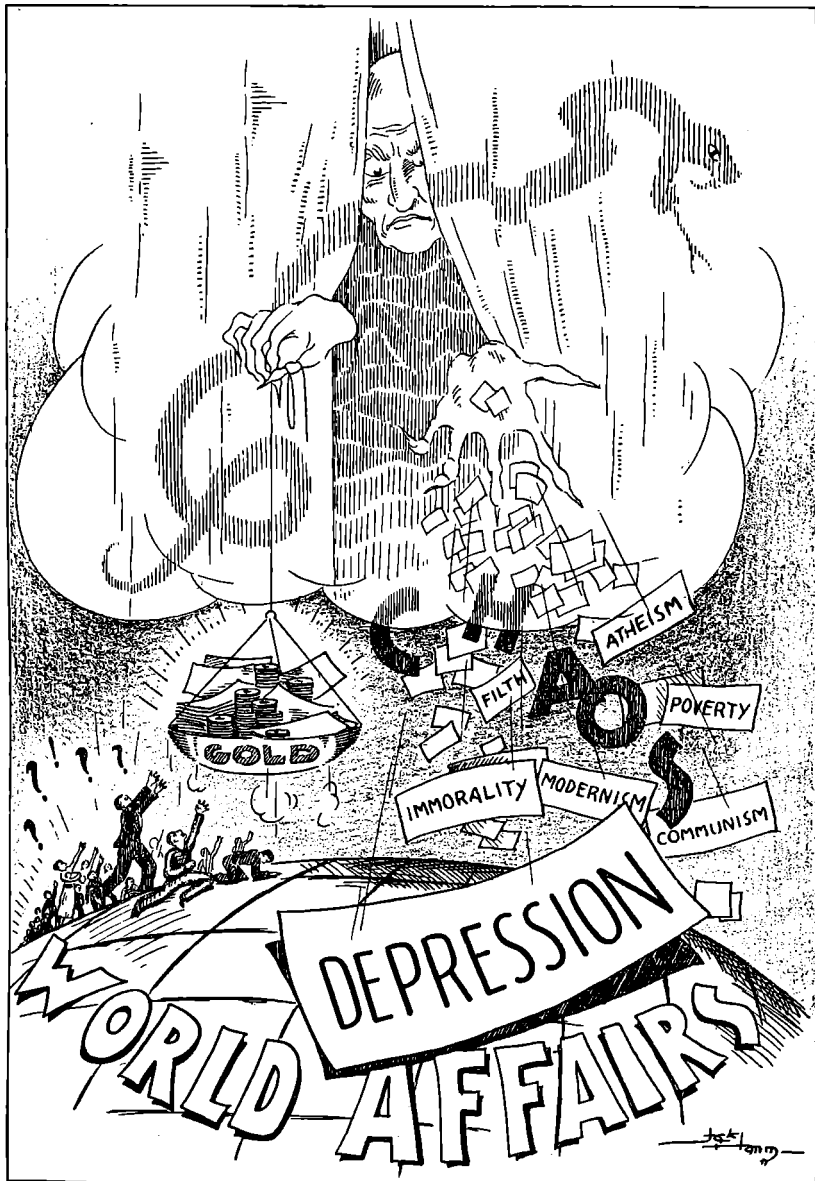
People reach for gold, not knowing that behind the scenes there is evidently a Hidden Jewish Hand characterized as the Symbolic Snake, which has produced the present Chaos by controlling the finances of the world.