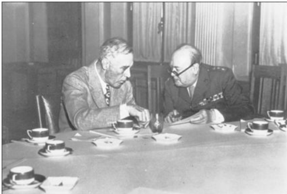
A visibly failing President Roosevelt confers with British prime minister Winston Churchill at the Yalta conference of February 1945. At the conference and in the weeks preceding, numerous observers said that they were shocked by the President’s appearance.

Suggesting that the British were more accurate than FDR’s admirers were episodes at Yalta—and other summits before then—that indicated an alarming lack of mental balance in his performance. There had been at least one suggestive incident at Teheran, reported by both Elliott Roosevelt and Bohlen, when Stalin urged the shooting of fifty thousand Germans as soon as they could be captured. This outraged Churchill as being contrary