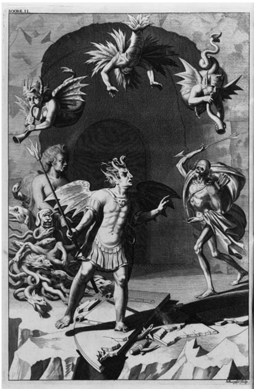
Figure 4 Illustration to Book 2, 1688