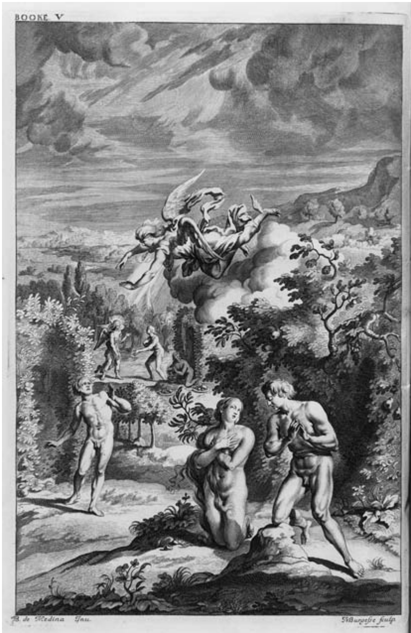
Figure 5 Illustration to Book 5, 1688 (John Baptista Medina)