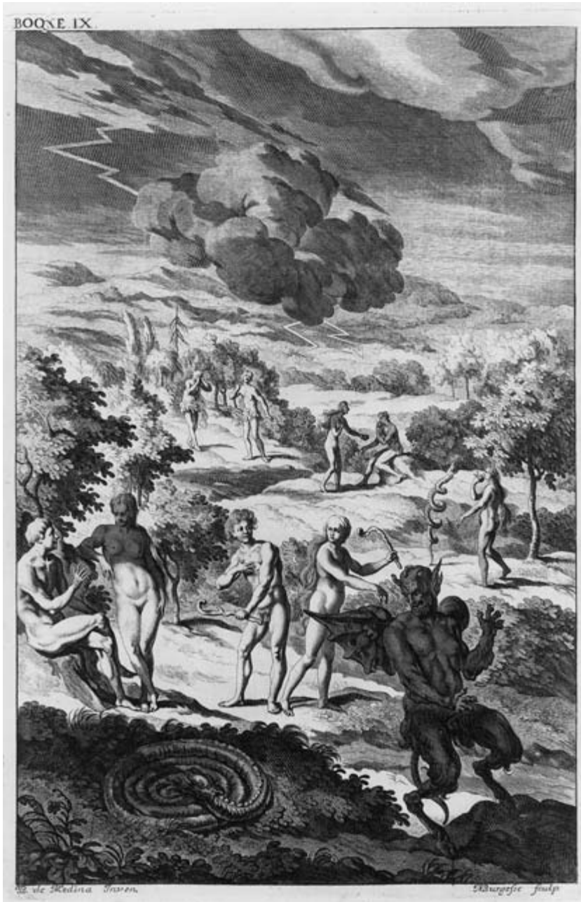
Figure 7 Illustration to Book 9, 1688 (John Baptista Medina)