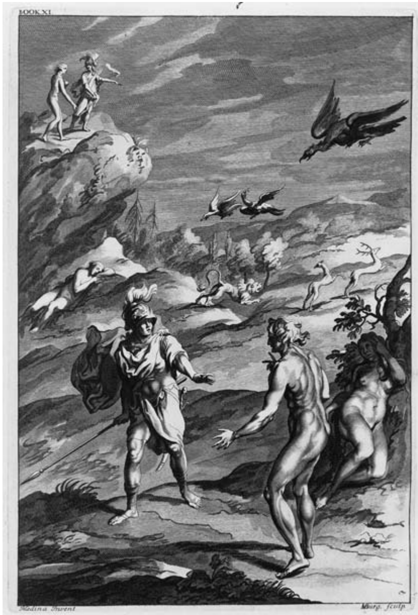
Figure 8 Illustration to Book 11, 1688 (John Baptista Medina)