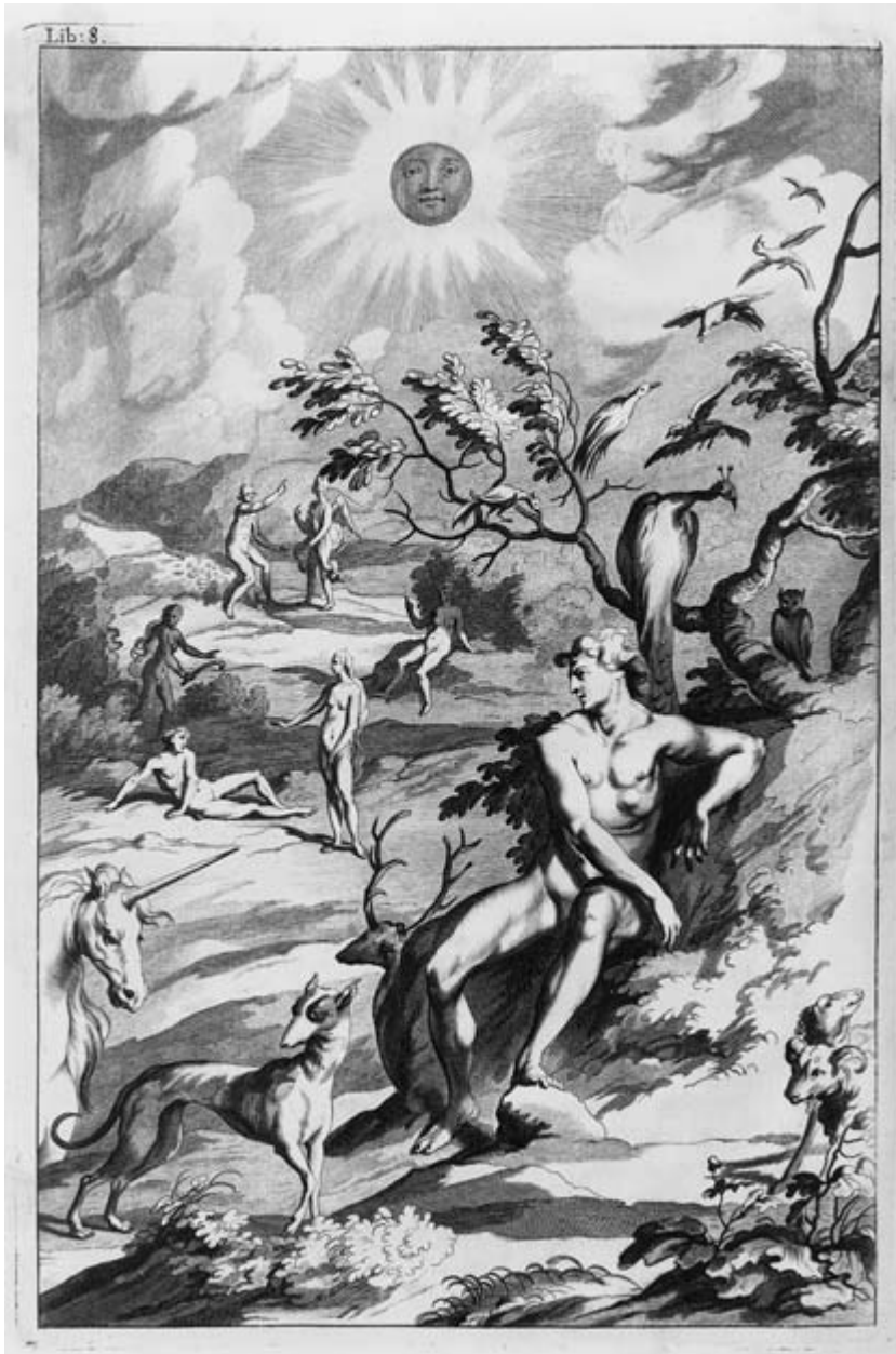
Figure 6 Illustration to Book 8, 1688 (John Baptista Medina)