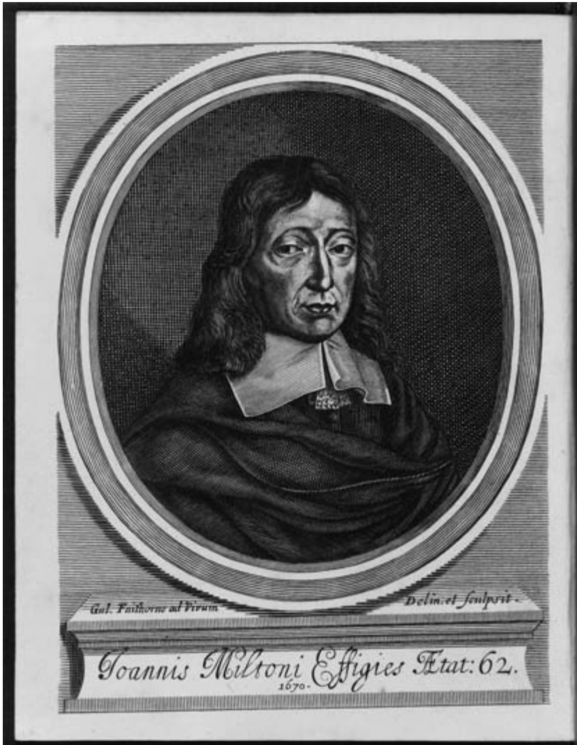
Figure 1 Engraved portrait of Milton at age 62 (William Faithorne)