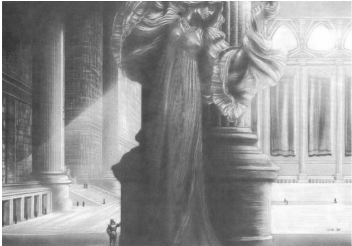
The Grand Reception Hall

If you are numbered among “the heartfelt pilgrims,” you will cross the last thousand meters of this approach to the temple of Alia on your knees. Those thousand meters fall well within the sweeping curves (background) leading your eyes up to the transcendent symbols dedicating this Temple to St. Alia of the Knife. The famed “Sun-Sweep Window” (left face of the Temple) incorporates every solar calendar known to human history in the one translucent display whose brilliant colors, driven by the sun of Dune, thread through the interior on prismatic pathways.