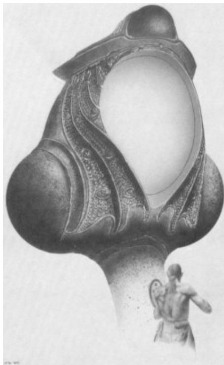
Ixian heating device

This Ixian heating device, set like a giant pearl in an ornate stand, greets you in a smaller passage of the Grand Palace. The ring-bound queue of the attendant servicing the device marks him as a city Fremen. On your walking tour of Arrakis, you will see many such Ixian artifacts, some set with rare gems, all worked in precious metals by dedicated artisans, some of whom devote years to the completion of a single decorative line. Attention to detail can be seen on this space heater. It incorporates twenty precious metals in each lapped scale.