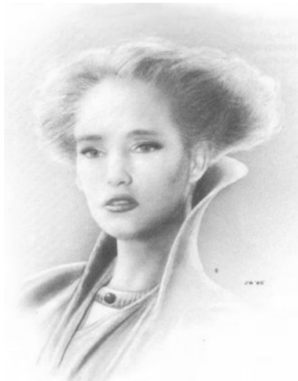
Princess Irulan Corrino

The glowglobe is of an ancient design and may have come from Caladan in the original Atreides migration. The cracked vasculature rim on the lower left side of the globe could indicate rough treatment in the Harkonnen attack. Many artifacts from those troubled times survived and were restored on orders of Muad'Dib himself. This authentic visage of the Princess Irulan, Muad'Dib's virgin consort, should be committed to memory before your walking tour of Arrakis. The pilgrim should beware of false images.