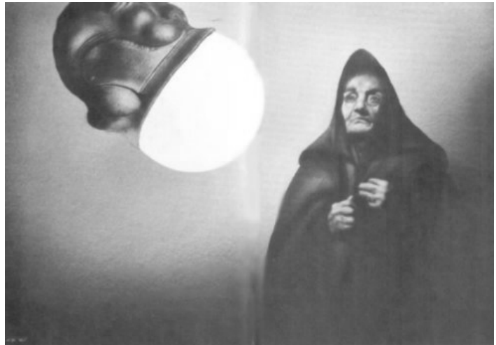
Reverend Mother Helen Mohiam

Rarely, in a private passage of the Grand Palace, the walking pilgrim will encounter the Reverend Mother Gaius Helen Mohiam. The famed Bene Gesserit graciously paused here to be recorded in the light of a glowglobe. Note her wedding bands. They signify her eternal bond to the Sisterhood.