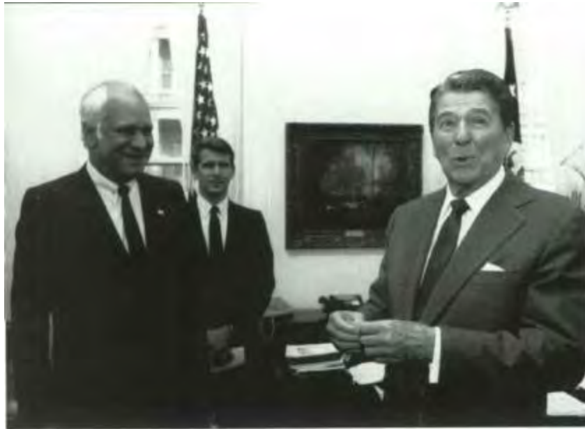
The Oval Office, April 4, 1985. From left: CIA agent Adolfo Calero, political boss of the FDN; Lt. Col. Oliver North and President Ronald Reagan, after the CIA handed off the day-to-day management of the Contra project to North and the National Security Council.