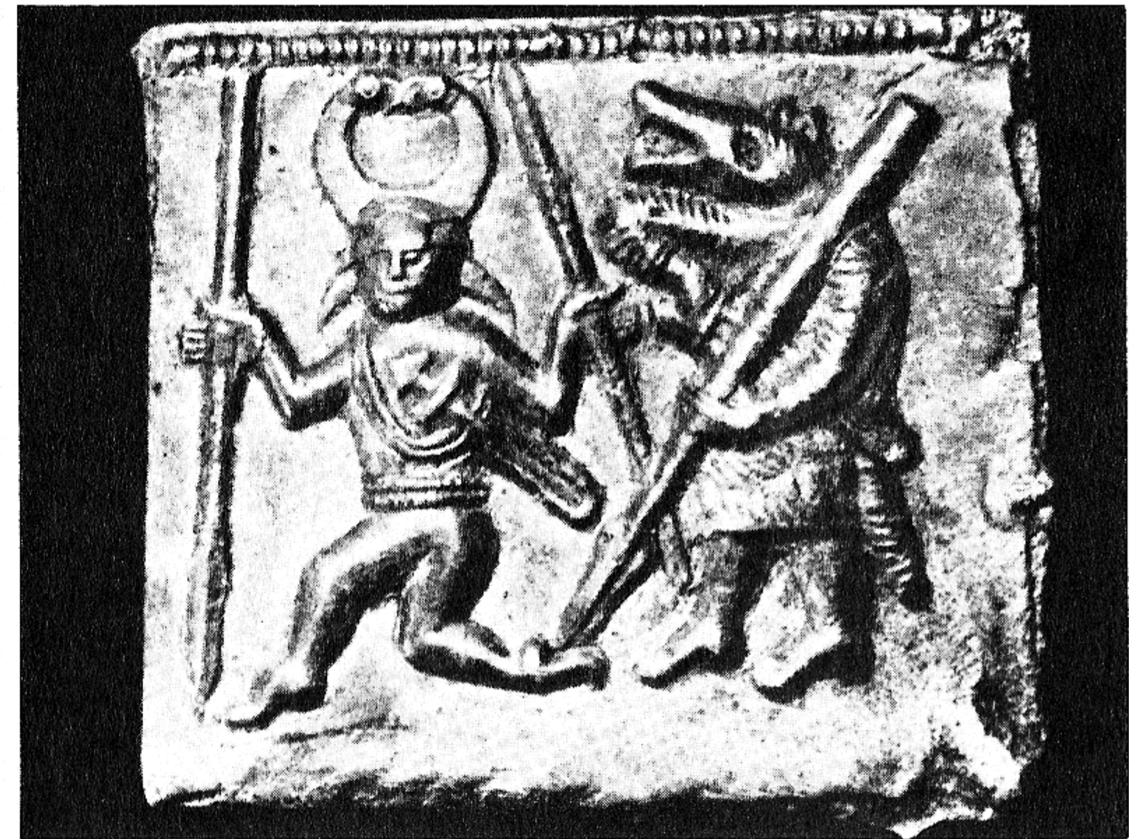
This sixth-century bronze die, one of four found at Torslunda (island of Öland) in Sweden, was used to make helmet plates. It depicts a young Odinic warrior in the presence of a berserk, not inappropriately for the Hatherus-Starcatherus encounter.

hand of a coward. A man may righteously choose to anticipate Destiny's law; what you cannot flee, you may even take in advance. A young tree must be nourished, an ancient one hewn down. Whoever overthrows what is close to its fate and fells what cannot stand is an instrument of Nature ( minister naturae est, quisquis fato confinia fundit. . . ). Death comes best when craved, life becomes tedious when the end is desired; do not let disagreeable age prolong an insupportable existence."