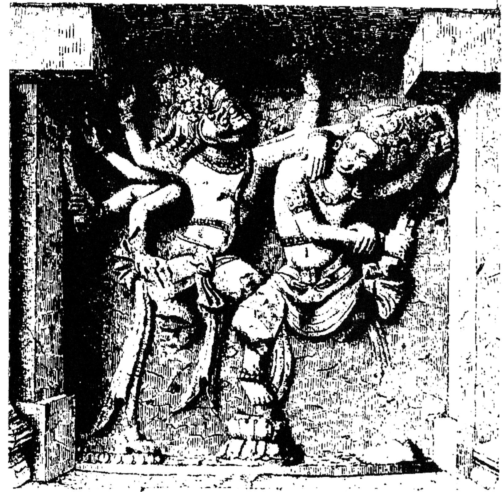
Viṣṇu as the man-lion (Narasimha) slays the demon Hiraṇyakaśipu, an earlier incarnation of Śiśupāla (relief from Ellora, India).