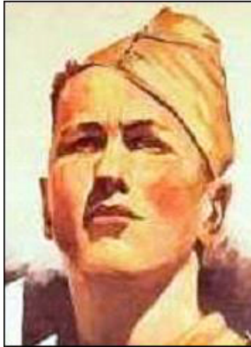
SS recruitment propaganda directed to the Hitlerjugend.

The Lebensborn also watches over the preservation and increase of pure blood. The Friend of the Soldier , op. cit.