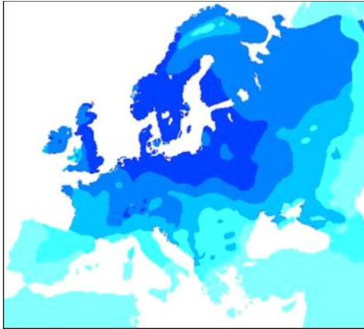
This map combines the distribution of hair and light eyes. It is not meant to be totally accurate but it gives us an idea.

The central sphere of the Nordic race includes the southern regions of Scandinavia, Jutland, the North Sea, the Baltic Sea, and extends to the heart of Germany.