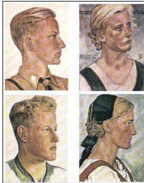
Examples of the Nordic ideal in the art and propaganda of the Third Reich.

Lebengeschichte des hellenischen Volkwes (Editor: Franz von Bebenburg, 1965).