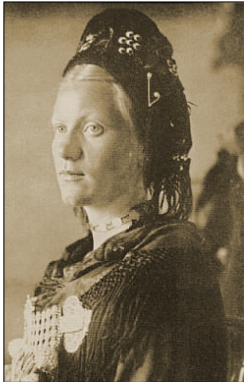
A woman from the North of Friesland. Both the Nazis and the American eugenicists agreed in considering the Frisians and the Saxons as the purest ethnic elements of Germany.

'New Foundations of Racial Science' (USA: Encyclopaedia of the Third Reich , published in 1934).