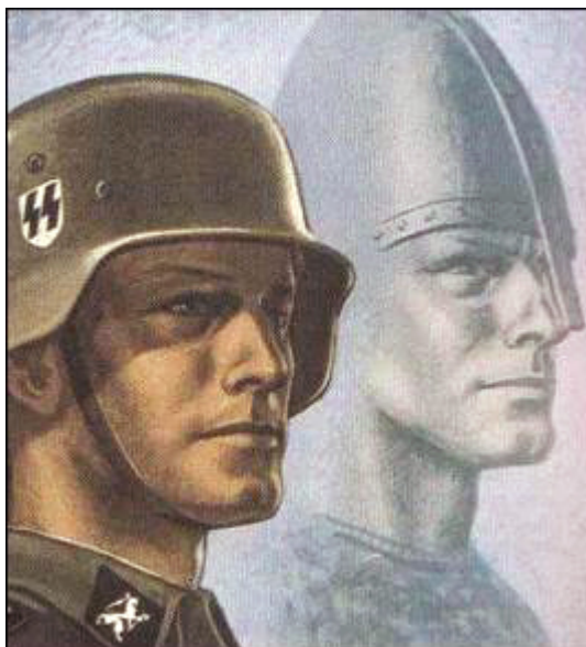
Recruitment poster for the SS

Heinrich Himmler (1900-1945). If the SS was a Nordacist institution, it was natural that its Reichsführer or Chief, was also a Nordacist.