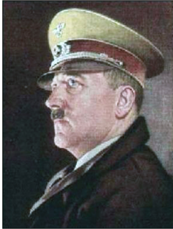
Adolf Hitler, in colour.

Renaissance Europe, the colonial empires, etc., considered the Nordic aspect as ideal, 'authentic', aristocratic, pure and uncontaminated; depositing in it the hopes for the future.