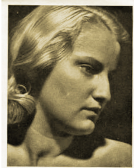
Gutes Blut – ewiger Quell!

Der Nordische Gedanke unter den Deutschen, 1927.