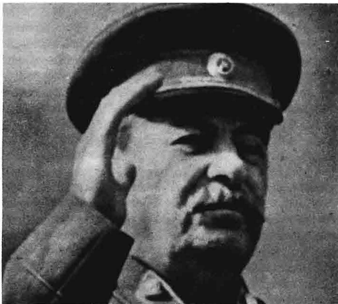
Stalin grew suspicious of Jewry

According to Dugin, the elimination of the Jewish Anti-fascist Committee, which was composed exclusively of