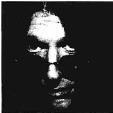
Howard Stern, the acceptable race-baiter