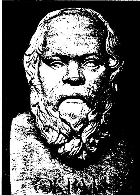
Socrates was wary

keep the truths about himself hidden from view. As a consequence, he will become embittered and try to get back at the straights who look down upon him. The situation has reached the point where toning down the stigma will do no good. A mind has been born. It wants to live, and it has a will-to-power. Legalizing it, or partially legalizing it, will not make it healthy. Homosexuality is corrupt in its essential nature. Unless we devise intelligent counter-measures or employ force more brutally than we would wish, the anti-racial homo mind is going to perpetuate itself indefinitely.