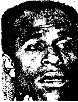
Fanon in 1957