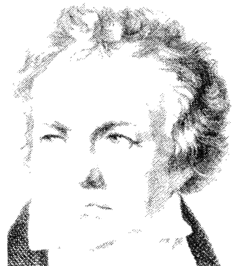
The unretouched Beethoven

By the way, the portrait below (taken from the Encyclopaedia Britannica , 1963) shows how Beethoven really looked.