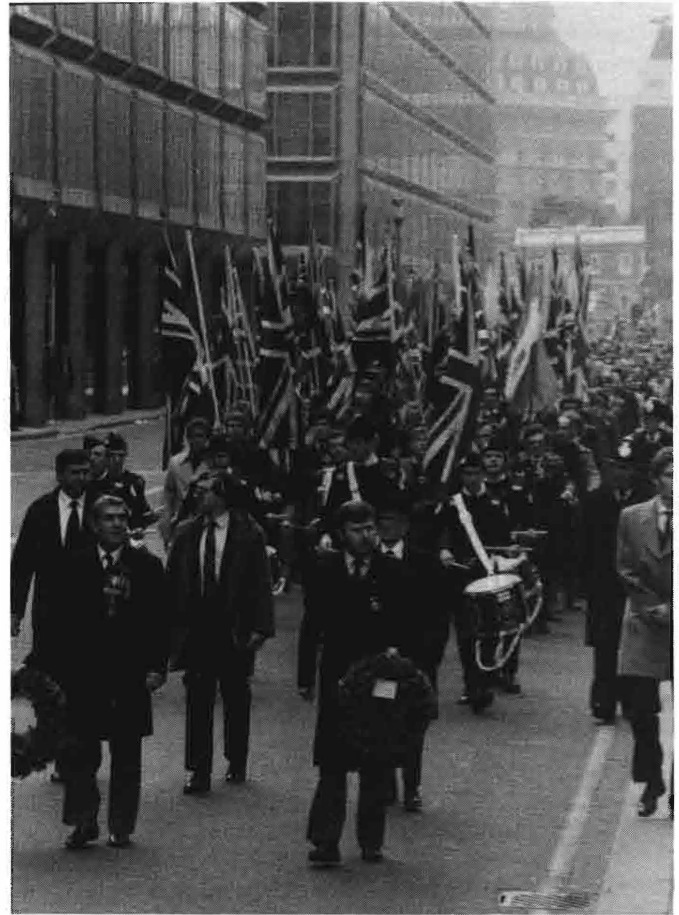
On the march in London

G: There is a great deal of political potential here, a potential that ought to come alive when your economy grinds down and the present artificial boom comes to an end. You have a lot of isolated talent, intelligent individuals in intelligent little groups, who would be much more important and wield much more influence in a smaller country like Britain. The United States is just too big. It's hard to organize anything in such a vast amount of space, though I suppose the inevitable advances in communications technology will help overcome this handicap. When the best of these groups and individuals manage to come together on