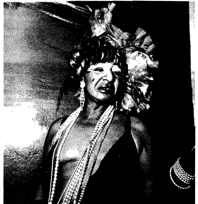
Transvestite at a drag ball