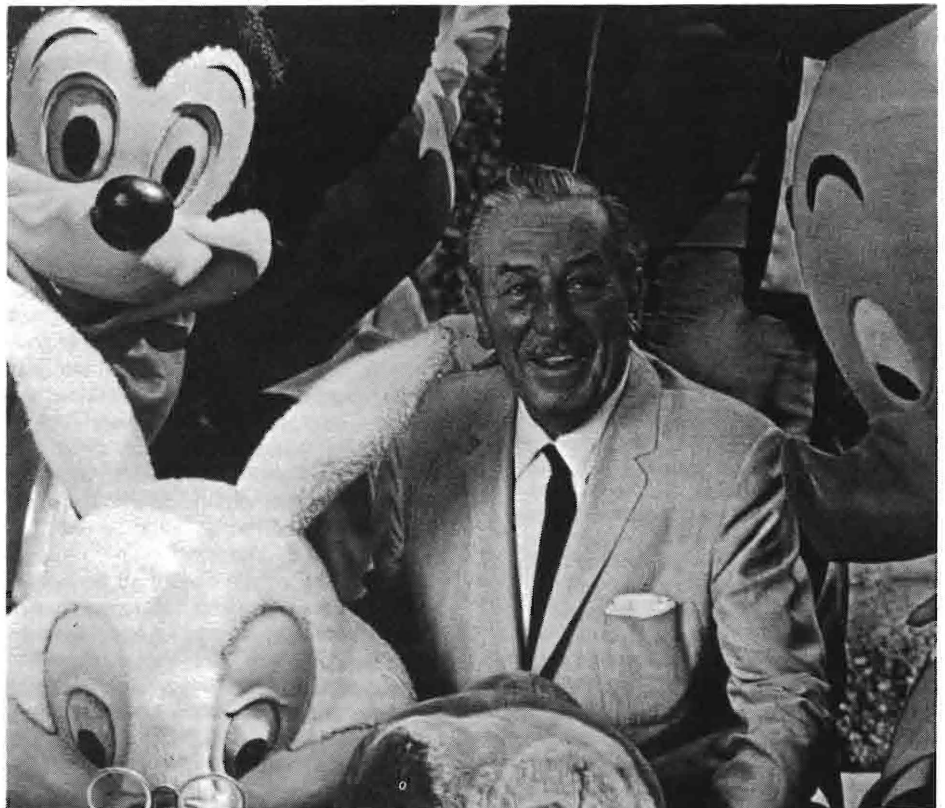
Walt would never have surrendered them to minority dynasts.

Stuck firmly between the Scylla of affirmative action and the Charybdis of the dynasts, the WASP is hard put to find a job in Hollywood these days. If it weren't for the aesthetic prop, still a box-office plus, the only Majority members in Hollywood would be floor sweepers.