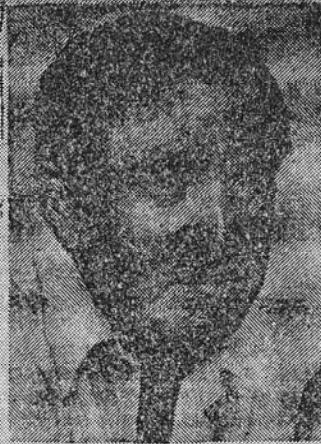
General Haim Herzog, who was appointed Israel Ambassador to the United Nations, assumed his position at the beginning of August.

This poisonous venom is calculated to arouse the American people to stark hatred of the Jews and the Jews are the major enemy of the fascist right. What is interesting about the NA is the fact that they openly call for soldiers to break the law, to violate their oath and to disobey orders. Yet nothing has happened and no one finds anything dangerous in this. C