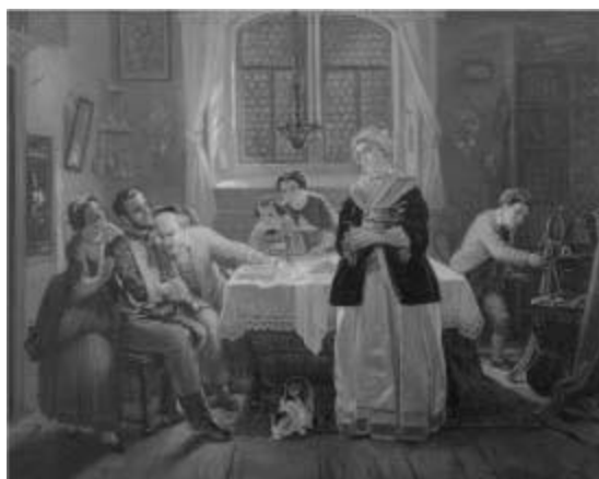
36. Return of the Jewish Volunteer from the Wars of Liberation to his family still living by the Old Custom. Oil painting by Moritz Daniel Oppenheimer 1833–34.