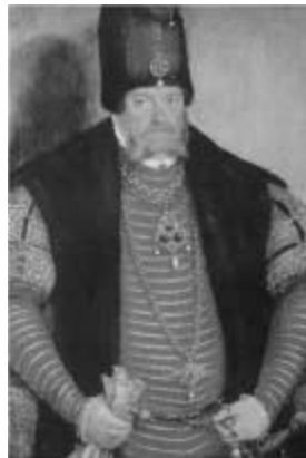
1. Lucas Cranach, Elector Joachim II (1535–71), painted c. 1551

For all his personal sympathy with the cause of religious reform, Joachim II was slow to attach his territory formally to the new faith. He still loved the old liturgy and the pomp of the Catholic ritual. He was also anxious not to take any step that might damage Brandenburg's standing within the fabric of the still predominantly Catholic Empire. A portrait from around 1551 by Lucas Cranach the Younger captures these two sides of the man. We see an imposing figure who stands with fists clenched before a spreading belly, decked in the bulging, bejewelled court garb of the day. There is watchfulness in the features. Wary eyes look out obliquely from the square face.