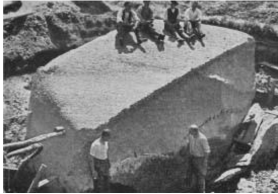
57. The 'Hindenburg stone': workers rest after excavating earth from under the monolith, photograph, c.1930s

that he should be buried 'under a single slab of East Prussian stone' the entrance to his tomb was surmounted with a huge lintel of solid granite, the 'Hindenburg Stone'. This stone had been unearthed near Cojehnen in the flatlands of northern East Prussia, and was well known to German geologists as one of the largest monoliths in the region. Working to tight deadlines, a team of stonemasons and mining specialists cleared the earth from around the granite mass, cut it with explosive charges and power tools into a vast oblong and transported it to the monument on a purpose-built railway. 96