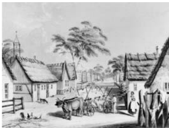
38. Old Lutheran settlement at Klemzig, South Australia, by George French Angas, 1845

For all these reasons, the efforts of Interior Minister von Rochow and his colleagues to put an end to the Old Lutheran movement were a failure, although they did cause several thousand separatists to seek their fortunes in North America and Australia. Prussians living along the banks of the river Oder were thus treated to an astonishing sight: barges full of law-abiding, hymn-singing Lutherans on their way to Hamburg for transfer to London and thence to South Australia, fleeing the religious persecution of the Prussian authorities. It was as if the great drama of the Salzburg Protestants (also Lutherans!) were being played out in reverse. The exodus was widely reported in the German press. It was all deeply embarrassing. The conflict was defused only in 1845 when Frederick William IV offered a general amnesty and granted the Lutherans the right to establish themselves within Prussia as an autonomous church association.