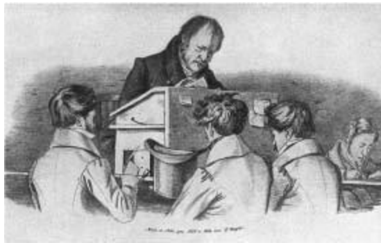
39. Hegel at the lectern, surrounded by students. Lithograph from 1828 by Franz Kugler.

It was the ideas themselves and the peculiar language Hegel invented to articulate them that colonized the minds of disciples across the kingdom. Part of the explanation lies in the context. Hegel's appointment was the work of the sometime Hardenberg protégé, enlightened reformer and Minister of Education Karl von Altenstein. The philosopher's writings provided an exalted legitimation for the Prussian bureaucracy, whose expanding power within the executive during the reform era demanded justification. Hegel steered a path between doctrinaire liberalism and restorationist conservatism – in an era of deepening political uncertainty, many found this via media enormously attractive. His writing balanced opposing standpoints, often with dazzling virtuosity. His dialectical wizardry, combined with an oracular and sometimes obfuscating mode of delivery, opened the work to diverse interpretations, enabling Hegelian language and ideas to flow seamlessly into the political ideologies of both right and left. 104 Finally, Hegel appeared to offer a means of reconciling the fact of political and social conflict with the hope for an ultimate harmony of interests and purposes.