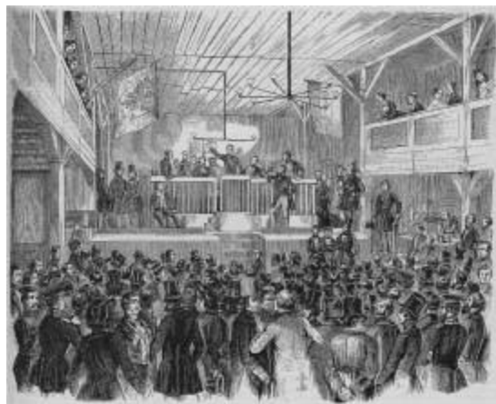
42. From the club life of Berlin in 1848. Contemporary engraving.

So poisonous was the mood in the city that men in uniform walking alone or in small groups were in serious danger. The liberal writer and diarist Karl August Varnhagen von Ense watched with mixed feelings from his first-floor window on 15 March as three officers walked slowly along the footpath of a street adjoining his house followed by a shouting crowd of about 200 boys and youths. ‘I saw how stones struck them, how a raised staff crashed down on one man’s back, but they did not flinch, they did not turn, they walked as far as the corner, turned into the Wallstrasse and took refuge in an administrative building, whose armed guards scared the tormentors away.’ The three men were later rescued by a troop detachment and escorted to the safety of the city arsenal. 6