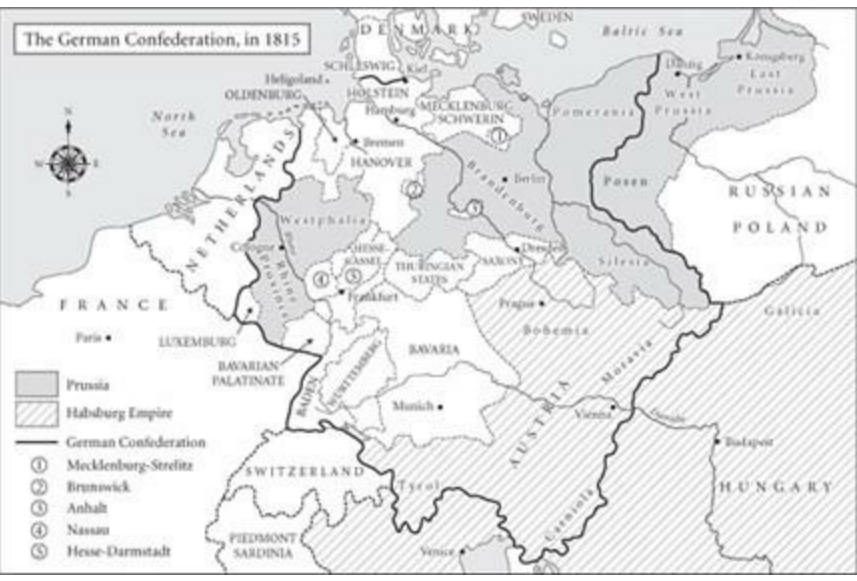
The German Confederation, in 1815