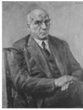
55. Otto Braun, Prussian minister-president. Portrait by Max Liebermann, 1932.

We might thus say that on 20 July 1932, the day of the putsch, the old Prussia destroyed the new. Or, to put it more precisely, particularist, agrarian Prussia laid an axe to the universalist, state-centred Prussia of the Weimar coalition. Traditional society, one might argue, prevailed at last over the modernizing state; the descendants of von der Marwitz triumphed over the spirit of Hegel. But this metaphorical antinomy, though it certainly captures part of the meaning of what happened in the summer of 1932, is perhaps too neat. The men of the putsch against Prussia were hardly Junkers of the classic type. Papen was a Westphalian Catholic, Wilhelm von Gayl a Rhinelander – both were, in this sense, ‘marginal Prussians’. 83 Even Kurt von Schleicher, though the son of a Silesian officer, was an untypical figure, a political intriguer from outside the provincial landowning elite; his politics, a hybrid blend of authoritarian corporatism and constitutionalism, remain difficult to pigeon-hole. 84 All three men pursued a politics of the nation, not of the Prussian state and certainly not of the Prussian province.