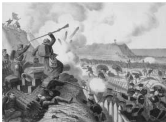
46. Prussian troops storm the Danish entrenchments at Düppel, 18 April 1864. Contemporary engraving.

The decision to attack Düppel was controversial. The Danish positions there were heavily fortified and manned, and it was clear that a Prussian frontal attack would succeed only – if at all – with numerous casualties. 'Is it supposed to be a political necessity to take the bulwarks?' asked Prince Frederick Charles, a brother of the king, who had been placed in charge of the siege. 'It will cost a lot of men and money. I don't see the military necessity.' 23 The case for engineering a showdown at Düppel was indeed political rather than military. A full-blown invasion of Denmark was undesirable for diplomatic reasons and the Prussians sorely needed a spectacular victory. There was much grumbling among the commanders, but Bismarck's will prevailed and the deed was done. On 2 April, the Prussians began a heavy bombardment of the defence works, using their new rifled field guns. On 18 April, the infantry went in under the command of Frederick Charles. It was no easy fight. The Danes offered fierce resistance from behind their battered defences and subjected the Prussians to heavy fire as they climbed the slopes before the entrenchments. Over 1,000 Prussians were killed or wounded; the Danes suffered 1,700 casualties.