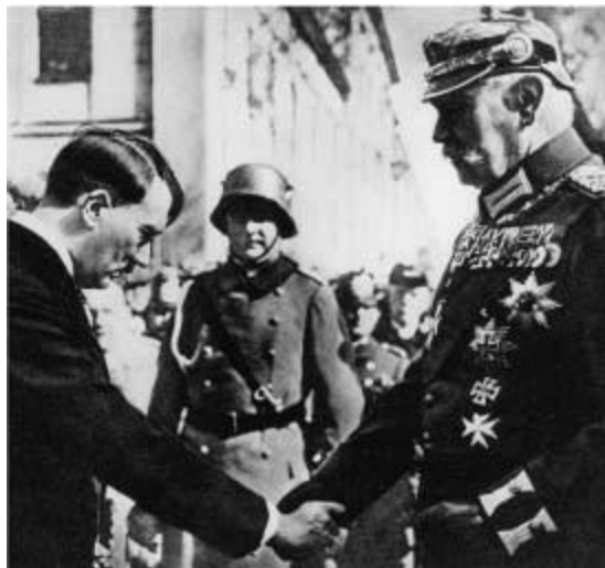
56. The Day of Potsdam, 21 March 1933. Hitler and Hindenburg shake hands in front of the Garrison Church in Potsdam.

In his speech to the assembled guests, Hindenburg expressed the hope that ‘the ancient spirit of this place of renown’ would enthuse a new generation of Germans. Prussia had earned greatness through ‘never-failing courage and love of fatherland’; might the same apply to the new Germany. In his reply from the reader’s lectern, Hitler – wearing a dark tailored lounge suit rather than his party uniform – expressed his profound veneration for Hindenburg and gave thanks for the ‘Providence’ that had placed this indomitable warlord at the head of the movement for Germany’s renewal. He closed with words that summed up the propagandistic function of the ceremony: ‘As we stand in this space that is