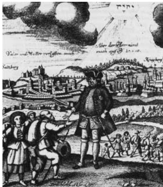
12. King Frederick William I of Prussia greets the Protestant exiles from the archbishopric of

Between April and July 1732, twenty-six columns of Salzburger families – each containing about 800 people – left for the long march through Franconia and Saxony to Prussia, exchanging the grassy slopes of their Alpine home for the flatlands of Prussian Lithuania. The emigration in itself was a sensation. The long lines of Salzburger trudging steadfastly northward through Protestant towns and cities in their outlandish Alpine gear had an electrifying effect on spectators. Peasants and townsfolk brought food, clothes or gifts for the children, others threw coins from open windows. Many were reminded of the children of Israel on their way out of Egypt. There was a flood of confessional propaganda; books and prints depicted the expulsion, praised the obdurate faith of the emigrants and lauded the pious Prussian king whose country had become a promised land for the oppressed. Over 300 independent titles (not counting periodicals) were published in sixty-seven different German cities during the years 1732 and 1733 alone. Throughout the eighteenth and nineteenth centuries, the legend of the emigration was endlessly recycled in sermons, pamphlets, novels and plays.