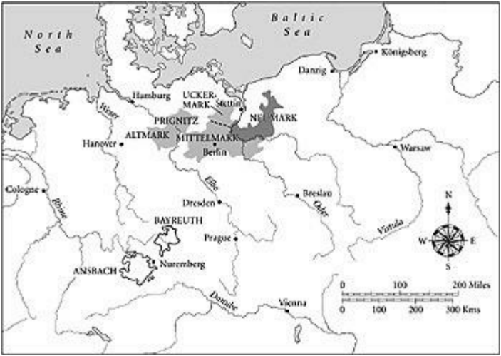
Map 1. The Electorate of Brandenburg at the time of its acquisition by the Hohenzollerns in 1415