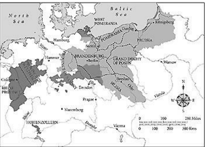
Map 5. Prussia following the Congress of Vienna (1815)