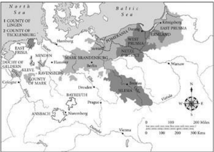
Map 3. The Kingdom of Prussia at the time of Frederick the Great (1740–86)