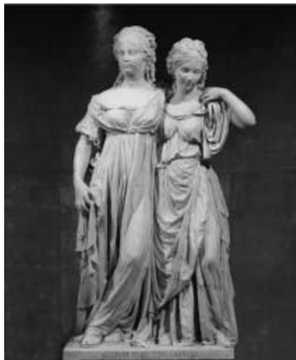
27. The princesses Luise and Frederike of Prussia. Die Prinzessinnengruppe by Johann Gottfried Schadow, 1795–97.

As queen, Luise occupied a much more prominent and visible place in the life of the kingdom than her eighteenth-century predecessors. In a notable break with tradition, she joined the king on his inaugural journey through the Prussian lands to receive the oath of fealty from the provincial Estates. During the endless meetings with local worthies, it was said that the new queen impressed everyone with her warmth and charm. She even became a fashion icon. The neckerchief she wore to keep colds at bay was soon widely imitated by women across Prussia and beyond. She was also an important partner to Frederick William in his official role. From the very beginning, she was regularly consulted on affairs of state. She cultivated the most important ministers and made it her business to be informed of political developments at court. It is striking that Stein thought it appropriate to approach the queen with his radical proposal for reform during the crisis of 1806, and equally significant that she should have chosen not to pass the document to her husband, on the grounds that it would merely vex him at a time of extreme stress. Luise provided psychological support for the hesitant king. ‘The only thing you need is more self-confidence,’ she wrote to him in October 1806. ‘Once you have that, you will be able to make decisions much more quickly.’ 12