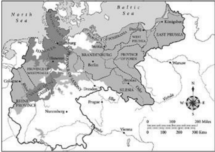
Map 6. Prussia at the time of the Kaiserreich 1871-1918