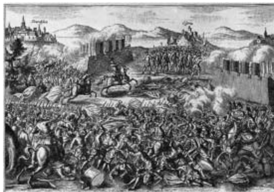
19. Battle of Kunersdorf, 12 August 1759. Contemporary engraving.

However, the very same tactics could also fail if they found the enemy prepared, were not supported by sufficient troop numbers or were based on a faulty understanding of the situation in the field. At Kolin (18 June 1757), for example, Frederick tried as usual to wheel around the Austrian right flank and roll the enemy up from the wing, but found that the Austrians, in anticipation of this, had extended their lines across his route of approach, committing him to a disastrous uphill frontal assault against heavily defended and numerically superior positions – here it was the Austrians who won the field, at a cost of 8,000 men to Prussia's 14,000. 33