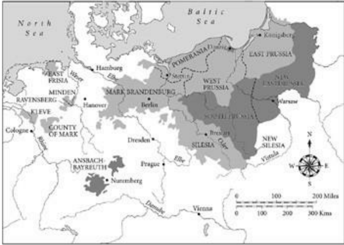
Map 4. Prussia during the reign of Frederick William II, showing the territories taken during the second and third partitions of Poland