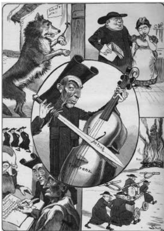
50. Anti-clerical stereotypes. Cartoon by Ludwig Stutz from the satirical journal Kladderadatsch, Berlin, December 1900.

Even if the support for Bismarck's policy had been more secure, it is