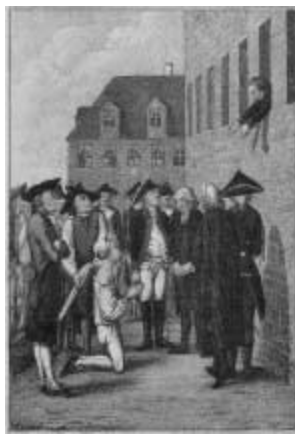
10. Crown Prince Frederick greets Katte through the window of his cell. Engraving by Daniel Chodowiecki.

Was this episode in Frederick's life a trauma that transformed the prince's personality? He had fainted into the arms of his guards before the moment of Katte's decapitation in Küstrin and remained in a state of extreme terror and mental anguish for some days, partly because he initially believed that his own execution was still imminent. Did the events of 1730 forge a new and artificial persona, acerbic and hard, remote from others, locked within the nautilus shell of a convoluted nature? Or did they merely deepen and confirm a tendency towards self-concealment and dissimulation that was already well developed in the adolescent prince? The question is ultimately unanswerable.