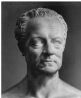
24. Karl August, Prince von Hardenberg. Marble bust by Christian Rauch, 1816.

Hardenberg attacked the problem with extraordinary determination and ruthlessness. The imperial nobles were shorn of their baroque privileges and constitutional rights, in flagrant breach of imperial law. Exchange agreements and jurisdictional settlements were put in place to eliminate enclaves and establish the borders as the impermeable frontiers of a homogeneous Prussian political sovereignty. The right of subjects to bring suits before the imperial courts was abolished, thus preventing the corporate nobility in the provinces from taking their grievances to the Emperor. Where there was resistance to his orders, Hardenberg was quick to send in troops and enforce compliance. These measures were supported by an innovative approach to public opinion – Hardenberg maintained contacts with several important journals in the region and discreetly cultivated friendly writers who could be depended upon to publish articles and editorials supporting his policy. 73