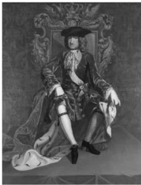
6. Frederick I, King in Prussia ( Elector 1688–1701; king 1701–13 ), painted after his coronation, attributed to Samuel Theodor Gericke

One of the reasons for adopting the title ‘King in Prussia’ – an unusual title that occasioned some amusement at the European courts – was that it freed the new crown from any Polish claims pertaining to ‘royal’ Prussia, which was still within the Polish Commonwealth. In negotiations with Vienna, particular care was expended to ensure that the wording of any agreement would make it clear that the Emperor was not ‘creating’ ( creieren ) the new royal title, but merely ‘acknowledging’ ( agnoszieren ) it. A much disputed passage of the final agreement between Berlin and Vienna paid lip service to the special primacy of the Emperor as the senior monarch of Christendom, but also made it clear that the Prussian Crown was an entirely independent foundation, for which the Emperor’s approval was a courtesy rather than an obligation.