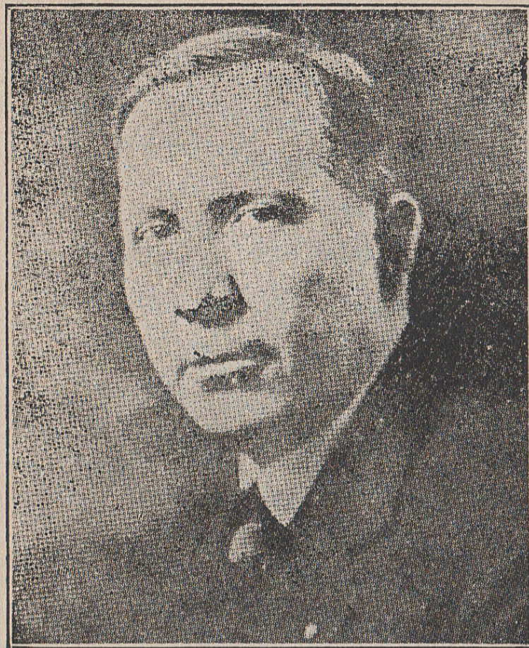
DR. H. W. EVANS Imperial Wizard of Ku Klux Klan